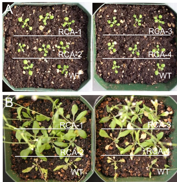
Fig. 2 Phenotypes of LtRCA -overexpressing plants under heat stress conditions. a Arabidopsis plants before heat stress treatment. b Arabidopsis plants after heat stress treatment. Arabidopsis plants were grown under normal growth condition (22 °C continuously) for 3 weeks (photo A was taken at day 20), then moved to a heat chamber (42 °C for 5 h and 22 °C for 19 h each day) until the end of the experiment (photo B was taken at day 40 after the start of heat treatment). WT, wild-type plants; RCA-1 to RCA-4, four independent LtRCA -overexpressing plants

In nature, abiotic stresses rarely come alone, instead they often come in various combinations, especially for drought and heat stresses. Therefore it would make more sense if we make plants more drought and heat tolerant