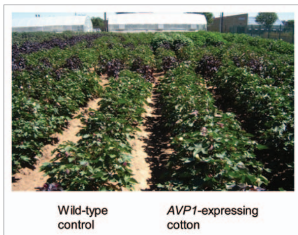
Figure 2. Wild-type and AVPI -expressing cotton plants grown in the dryland field condition. Plants were planted in the middle of May 2009 and the picture was taken in the middle of July 2009 at the USDA Experimental Farm in Lubbock, Texas.

The larger root systems of AVPI -expressing cotton plants under saline and water-deficit conditions allow transgenic plants access to more of the soil profile and available soil water resulting in increased biomass production and yield. Li et al. showed that the larger root systems of AVPI -overexpressing Arabidopsis is caused by increased auxin polar transport in the root, which stimulates root development in AVPI -overexpressing Arabidopsis plants. Furthermore, a recent comparative study of transgenic Arabidopsis lines that produce enlarged leaves showed that auxin levels were increased by 50% in AVPI -overexpressing plants. 11 To test if altered auxin level is responsible for the observed