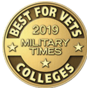
Military Times Best for Vets since 2013

For armed forces veterans transitioning to civilian life, MVP establishes educational benefits, encourages campus and community engagement, and works to ensure degree completion. Services are also provided to veterans' family members in order to create a community of support and success.