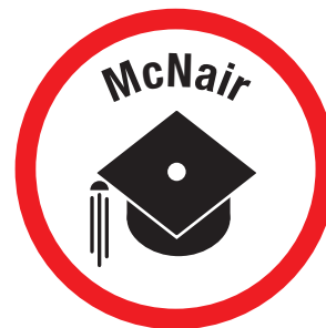
30+ Student led research project