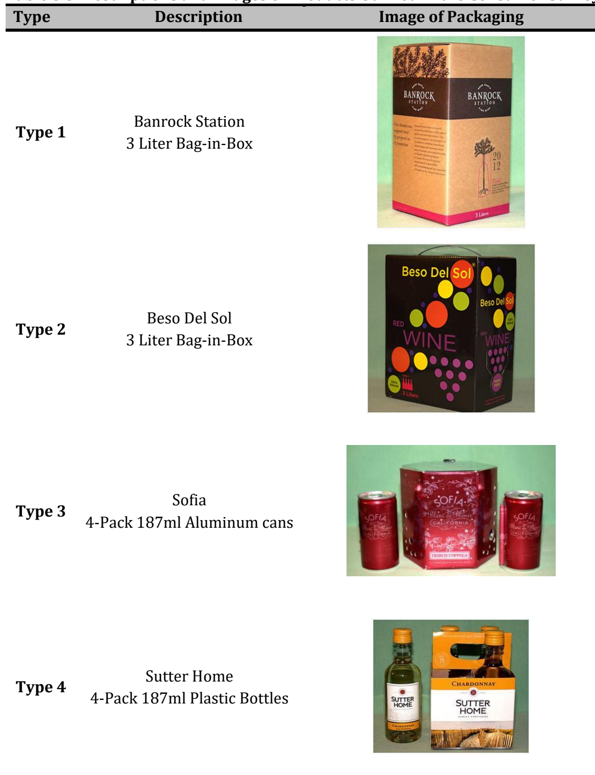
Table 5.3. Descriptions and Images of Products Utilized in the Consumer Survey

Based on the information obtained from the focus groups (section 4), the researchers selected particular types alternative wine packaging to explore further in the consumer survey. Participants were asked to evaluate each of the images in Table 5.3 .