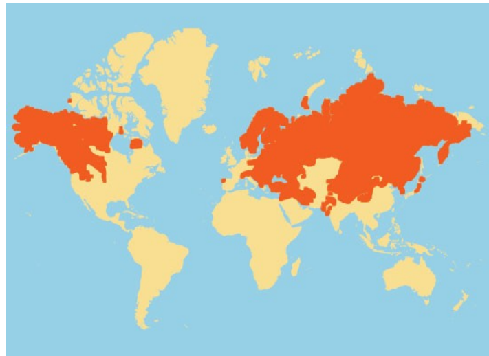
Brown bear distribution

Brown bears ( Ursus arctos ) occur in Canada, the United States (primarily Alaska, with smaller populations in Montana, Wyoming, Idaho, and Washington), and across northern Europe and Asia.