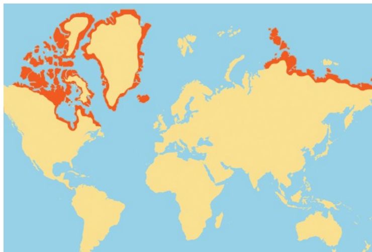
Polar bear distribution

Polar bears ( Ursus maritimus ) occur along the northern coasts and in the arctic waters north of Alaska, Canada, Greenland, Norway, and Russia.