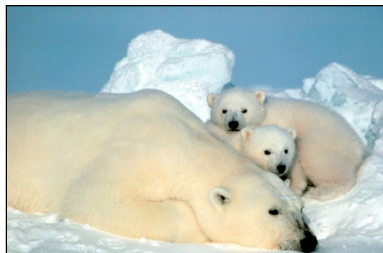
Polar bear mother and cubs.

Evolutionary studies suggest that polar bears evolved from brown bears during the ice ages. The oldest polar bear fossil, a jaw bone found in Svalbard, is dated at about 110,000 to 130,000 years old. DNA comparisons suggest the species may have split at least 150,000 years ago, and maybe longer. The timing of when polar bears first appeared as a species is important because it will determine when they experienced warm periods with little sea ice in the past, and help assess their response to current changes in sea ice.