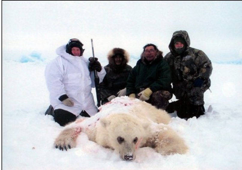
This wild hybrid, a cross between a polar bear and brown bear, was shot by a hunter in Northwest Territories, Canada, in 2006. At the time, it was the only wild bear proven by genetic analysis to be a hybrid. It exhibits the overall white coat of a polar bear, but the areas of areas of brown fur, dished face, extra-long claws, and slightly humped back are characteristics of a brown bear.

Evolutionary studies suggest that polar bears evolved from brown bears during the ice ages. The oldest polar bear fossil, a jaw bone found in Svalbard, is dated at about 110,000 to 130,000 years old. DNA comparisons suggest the species may have split at least 150,000 years ago, and maybe longer. The timing of when polar bears first appeared as a species is important because it will determine when they experienced warm periods with little sea ice in the past, and help assess their response to current changes in sea ice.