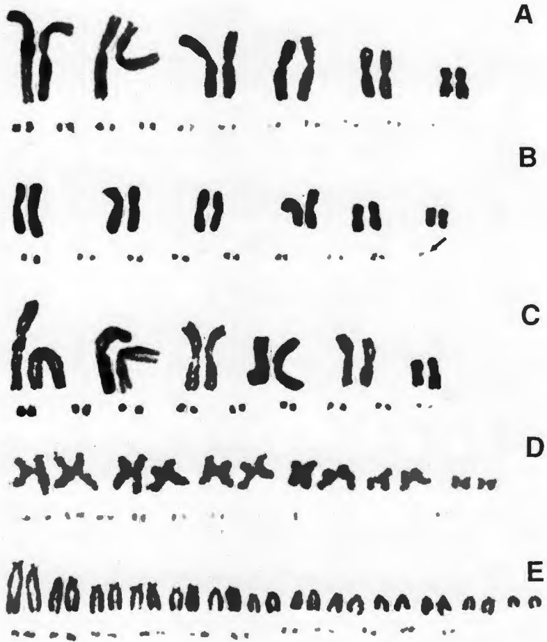
FIG. 1—A) Karyotype of female Leiocephalus carinatus ; B) karyotype of male Leiocephalus raviceps showing the heteromorphic pair of sex chromosomes (arrow); C) karyotype of female Leiocephalus raviceps ; D) karyotype of male Anolis porcatus ; E) karyotype of female Ameiva auberi .

number of microchromosomes as the males, but did not have the unusually small microchromosome. These data suggest that L. raviceps has an XX/XY sex chromosome system, with the Y chromosome being minute, as has been reported in several species of the sceloporine genera Uta (Pennock et al. , 1969) and Sceloporus (Cole, 1971a, 1971b, 1978). The minute Y was seen in some of the secondary spermatocytes examined from males of this species. The remainder of the spermatocytes presumably possessed