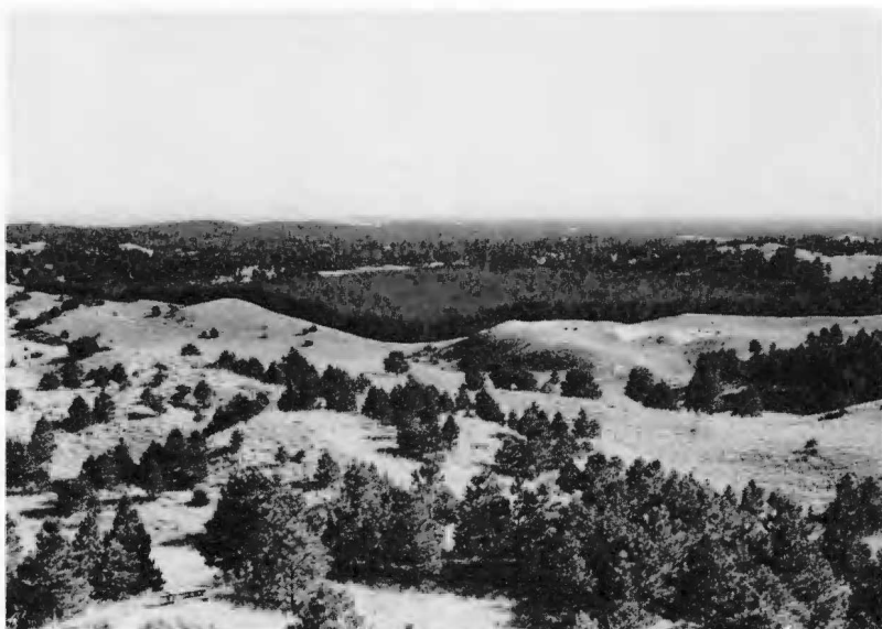
FIG. 10.—The fire of 1965 turned a large part of the man-planted forest into a different habitat, as shown in the foreground. Here, clumps of conifers and single trees are scattered throughout the grassland. The fine textured vegetation in the center is a plantation of eastern red cedars. Stands of unburned pines are in the distance. Prior to afforestation, the land in this photograph looked like that in Figure 3.

museums (209), and personal communication with forest personnel and colleagues who have observed or collected mammals on the forest property. Common and scientific names follow Jones and Choate (1980) and Jones et al. (1986). Except for Sorex cinereus (see van Zyll de Jong and Kirkland, 1989), subspecific names are based on information in Jones (1964) and Hall (1981).