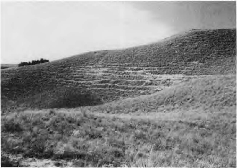
FIG. 6.—A catstepped slope in the Bessey Division. Exposed strips of sand on the banks of the dunes give the slopes a terracelike appearance.

today, 68.8 percent are ponderosa pine ( Pinus ponderosa ) with eastern red cedar ( Juniperus virginiana ) and jack pine ( Pinus banksiana ) constituting 20.5 percent and 10.2 percent, respectively. The remaining conifers consist of Scotch pine ( Pinus sylvestris ), Austrian pine ( Pinus nigra ), and red pine ( Pinus resinosa ). Trees were planted equidistantly in straight rows. Today, some natural reproduction of these conifers occurs on the property. Cattle are allowed to roam through some of the plantations. We investigated habitat utilization of mammals only in the three main monocultures and their descriptions follow. Information regarding boundary lines of the forest property and plantations, and the number of trees planted and thinned, are based on the most recent information available from forest personnel.