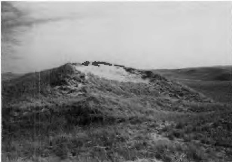
FIG. 5.—Blowouts are large scooped-out depressions in sand dunes. These sandy areas are common throughout the Bessey Division.