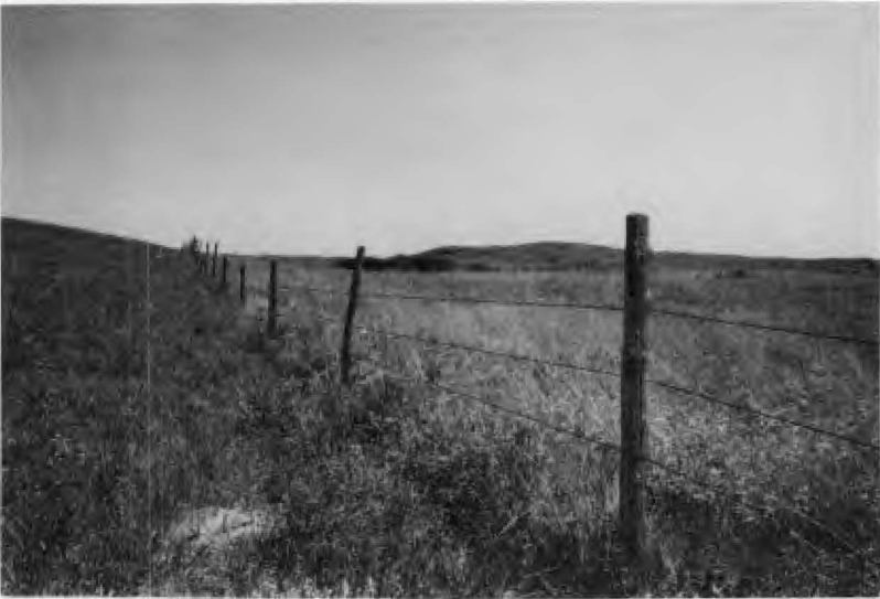
FIG. 4.—A fenced area separates grazed (left) and ungrazed (right) portions of native grasslands on the Bessey Division. Not surprisingly, vegetation is taller and thicker in the absence of grazing from cattle or mowing.