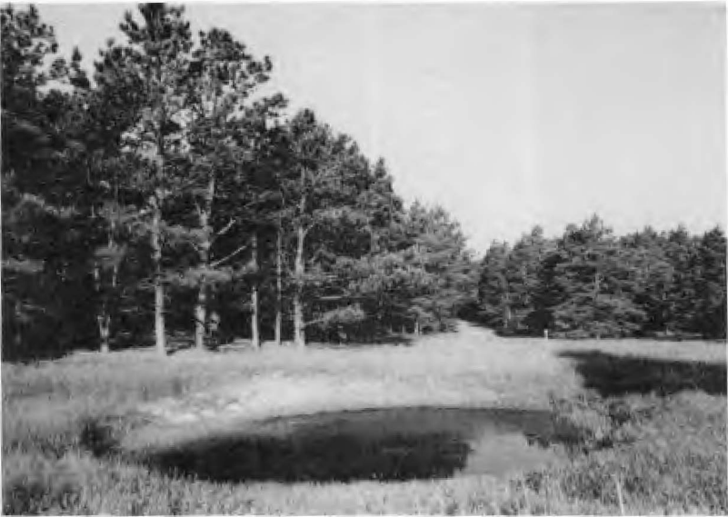
FIG. 8.—A plantation of ponderosa pine surrounds a grassy clearing containing an earthen pond.

Jack pine plantations. —This coniferous species also was planted in rows, approximately two to three meters apart and individually spaced about two to three meters apart. Diameter at breast height averages 20 centimeters. Litter accumulation is five to 10 centimeters deep directly below the trees and slightly less away from the base. More light reaches the ground in stands of jack pine than in those of ponderosa pine because jack pines have fewer and shorter branches and their needles are smaller (Fig. 9). Some stands (11.8 percent) have been thinned (alternate trees cut and most removed), and in these relatively open areas, poison ivy grows in thick patches. Other understory vegetation includes snowberry, eastern red cedar, and monocots. Many tree trunks and branches are scattered throughout these thinned areas. Most of our trapping in stands of jack pine was conducted in areas that had been thinned.