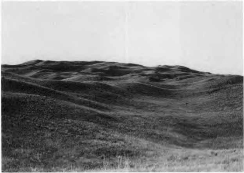
FIG. 3.—Grazed portion of the native grassland on the Bessey Division. Dominant grasses include little bluestem, prairie sandreed, and needle-and-thread.

of the management plan for this plot. Dominant grasses include little and sand bluestem, prairie sandreed, needle-and-thread, sand lovegrass ( Eragrostis trichodes ), prairie June grass ( Koeleria pyramidata ), and switchgrass. Forbs and shrubs are the same as those on grazed areas. Ungrazed areas resemble grazed areas in topographic features; not surprisingly, however, vegetation is taller and thicker, and ground cover is denser (Fig. 4).