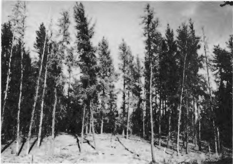
FIG. 9.—Plantation of jack pine that has been thinned.

throughout the burned plantations. Only small amounts of litter occur under and around the trees. Young cedars, ponderosa pine, and jack pine saplings have invaded the open grassy areas. Bluestem grasses, prairie sandreed, needlegrass, sand lovegrass, switchgrass, and prairie June grass commonly are found in the burned plantations as are yucca, sand cherry, wild plum, snowberry, poison ivy, prickly pear, wild rose, and leadplant. Certain areas of the burned plantations are not grazed by cattle; in these areas, grasses are nearly as thick as in the "Natural Area." Blowouts and catstepped areas also occur in the burned areas, but we did not trap in these sandy habitats of the plantations. Basically, burned plantations are grasslands with scattered trees and many fallen logs.