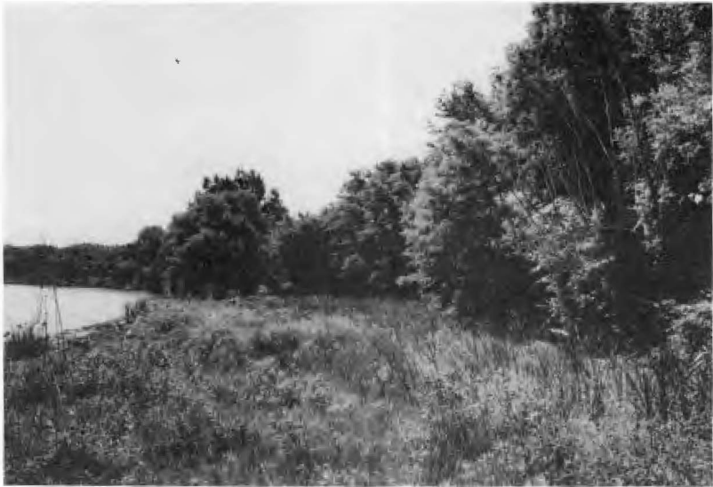
FIG. 2.—Riparian habitats along the Middle Loup River. Wet subirrigated areas adjacent to the river are dominated by cattails, sedges, and grasses, whereas higher, well-drained areas are farther from the water and are dominated by deciduous trees and bushes.

Subirrigated areas. —Within the riparian habitat, there are areas immediately adjacent to the rivers that are subirrigated and wet. Soggy areas and standing water are common, especially in spring. This habitat is dominated by cattails ( Typha latifolia ), sedges ( Carex ), reed canary grass ( Phalaris arundinacea ), goldenrod ( Solidago ), willow ( Salix ), and red osier dogwood ( Cornus stolonifera ). The Dismal River has fewer and narrower bands of subirrigated habitat than the zone along the Middle Loup. Where we trapped, the bands were 30 meters and 40 meters at their widest extent on the Dismal and Middle Loup rivers, respectively.