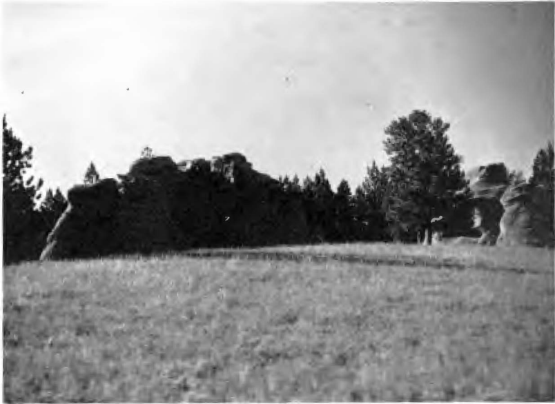
FIG. 2.—Typical rock formation at Medicine Rocks State Park.

who identified stomach contents for us, M. leibii masticates its food to a finer degree than do other species of bats here reported.