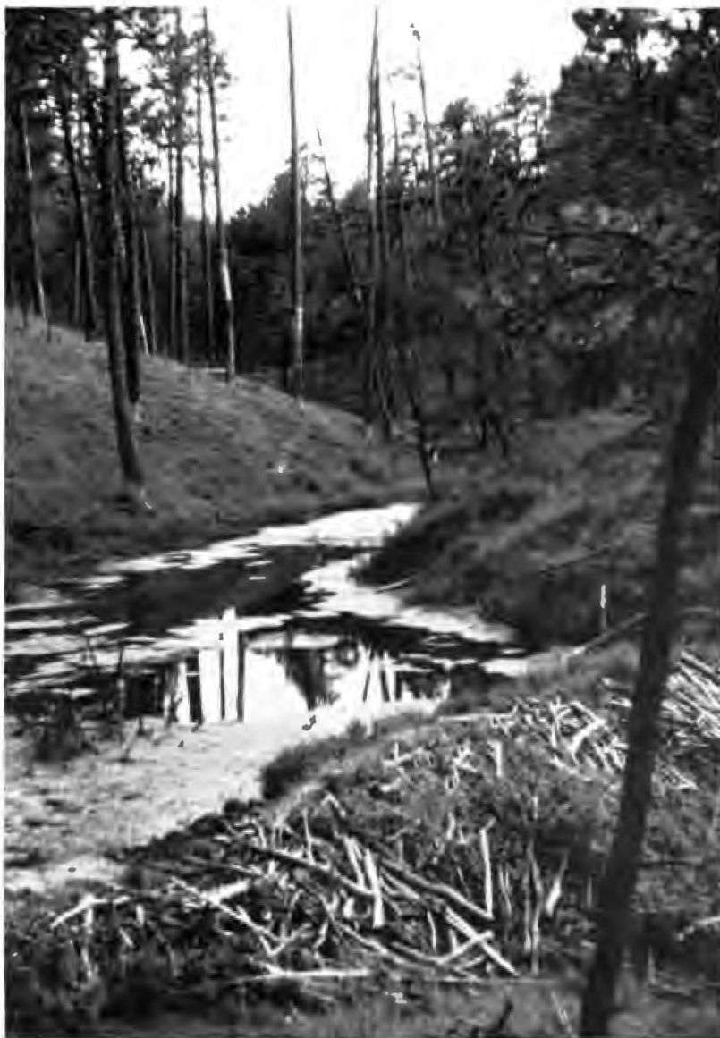
FIG. 3.—Beaver pond on Slick Creek, 7 mi. N and 10 mi. W Camp Crook. All seven species herein reported were netted over this and adjacent ponds.

ments, and the last contained a cicadellid, a small lepidopteran, and an unidentified coleopteran.