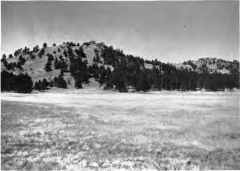
FIG. 1.—View of eastern edge of Long Pine Hills showing prairie and pine-clad slopes. Impoundments in such areas were used by all species recorded in this study as a source of water.