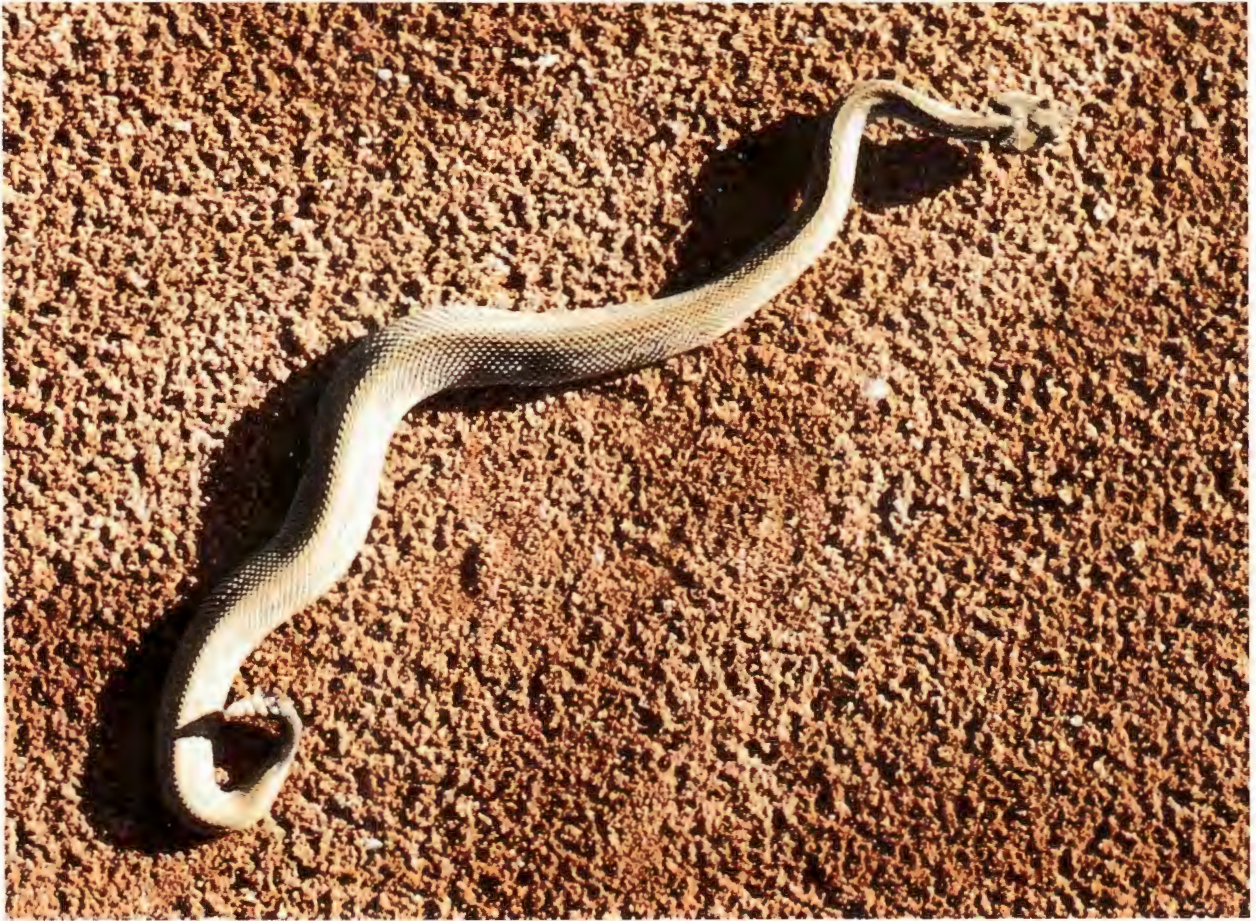
Fig. 1. Aberrantly patterned juvenile western diamondback rattlesnake acquired from Haskell County, Texas. Faint longitudinal stripe appears to be the result of blotch pattern transformation. Snout to vent length of this specimen is 450 mm.

northern pacific rattlesnake ( C. v. oreganus ), the southern pacific rattlesnake ( C. v. helleri ), the Panamint rattlesnake ( C. mitchellii stephensi ) (Klauber, 1972), and the western massasauga ( Sistrurus catenatus tergimimus ) (Irwin, 1979). However, in aberrant individuals of these taxa, the longitudinal stripe only extends two-thirds the length of the body or less (Klauber, 1972; Irwin, 1979). Complete blotch transformation (longitudinal stripe from head to tail) in rattlesnakes formerly was known only on the basis of four individuals. One was a timber rattlesnake ( C. horridus ) reported by Gloyd (1935). Interestingly, the other three were western diamondbacks from Texas, one from Bexar County, one from adjacent Comal County, and the other from an unknown place in southeast Texas (Gloyd, 1958; Klauber, 1972). In addition, Tennant (1984) reported that in 1981 two "almost patternless cinnamon-gray" specimens were collected from the Williamson County area of Texas, which