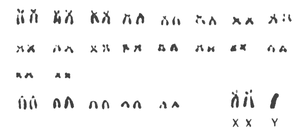
Figure 1. Nondifferentially stained karyotype of a female Peromyscus maniculatus labecula (TK 48717) and the Y chromosome of a male P. m. labecula (TK 48719) from Durango, Mexico.

Reithrodontomys megalotis megalotis.— This karyotype is identical to that reported by Robbins and Baker (1980), and Hood et al. (1984) for populations