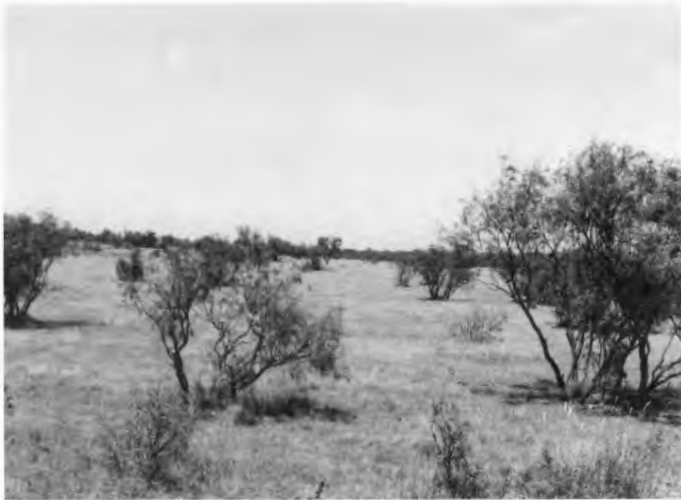
Figure 4. Mesquite grassland habitat at Lake Meredith National Recreation Area.

Additional records. — Potter Co.: Unspecified locality (Schmidly, 1991:100; Davis and Schmidly, 1994:49).