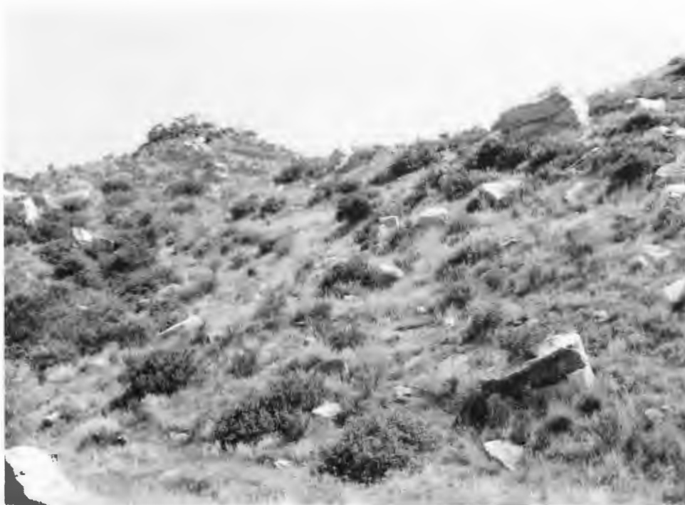
Figure 3. Typical rocky upland habitat at Lake Meredith National Recreation Area. Note common shrub and grass species amongst the boulders.

areas. The individual we took (collected on 10 July) was a male with testes that measured 10 x 5.