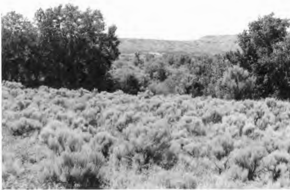
Figure 2. Typical riparian habitat along the Canadian River at Lake Meredith National Recreation Area. Dense vegetation at foreground is sand sage; mature cottonwood trees flank salt cedar and false willow in background.

1991). No specimens were taken during our survey and there are no records from Lake Meredith NRA. However, this species is known from Hutchinson County.