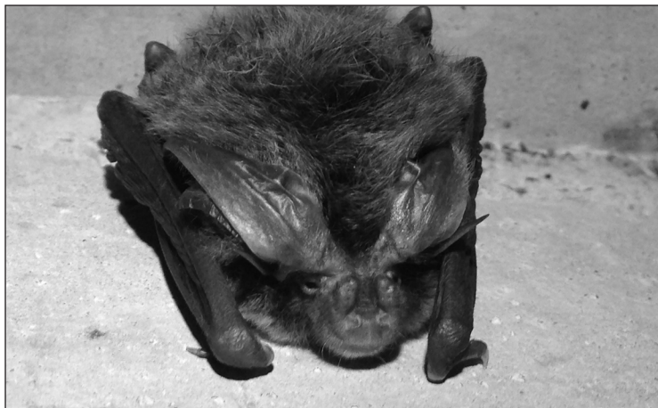
Figure 2. Corynorhinus rafinesquii observed roosting in a box culvert in Marion County, Texas, on 26 January 2017.