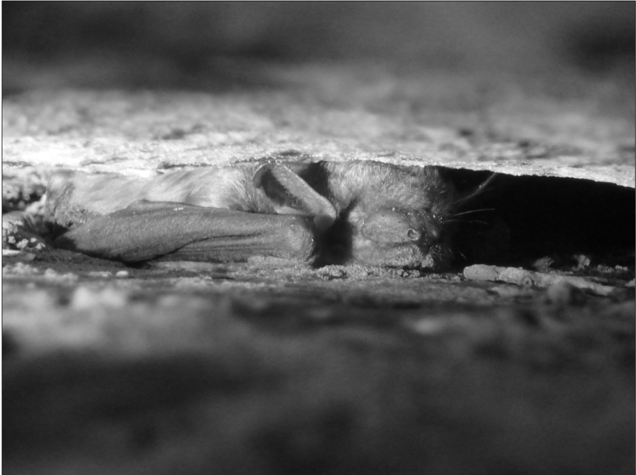
Figure 3. Eptesicus fuscus observed roosting in a gypsum cave system in Scurry County, Texas, on 5 February 2017.

Bowie County. —On 27 January 2017, a Southeastern Myotis of unknown sex was observed roosting in a culvert along I-30 near Hook, Texas (33.46593°N, 94.23925°W). This individual was located approximately 30 m from the entrance of the culvert at a height of 2.3 m and was alert and responsive. Due to the roosting height of the bat, this individual was not swabbed nor tested for signs of P. destructans and was not collected as a voucher. Although not a county record for the species (Schmidly and Bradley 2016), this documentation of M. austroriparius represents the first winter observation of the Southeastern Myotis for Bowie County.