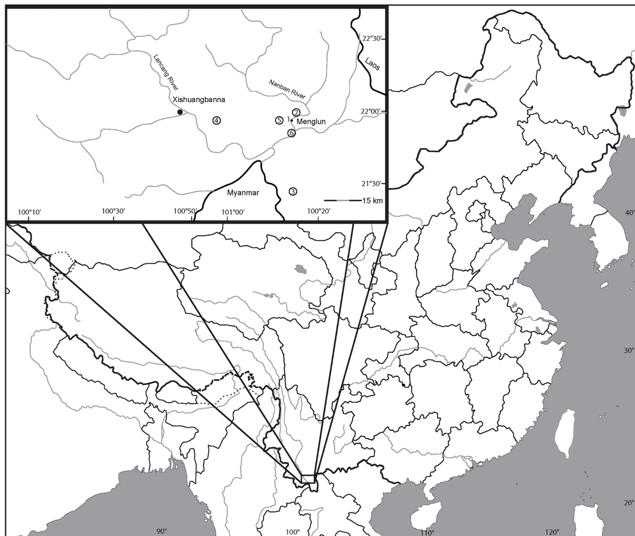
Figure 1. Map of collecting locations in Yunnan province, China. The study sites were as follows: Menglun/Gourd Island (21°56'12" N, 101°15'7" E), study site 2 (21°56' N, 101°18' E), study site 3 (21°39' N, 101°15' E), study site 4 (21°55' N, 100°57' E), study site 5 (21°55' N, 101°12' E), and study site 6 (21°53' N, 101°15' E). All locations shown above are placed as accurately as possible given the tag information from gathered specimens.

maxillary were compared with the figures in Feng et al. (2007). This species was found within the recorded geographic range as given by Wilson (2013).