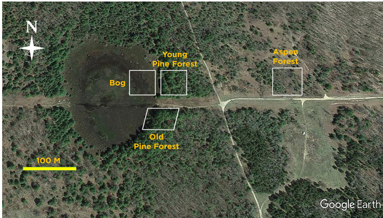
Figure 1. Locations and habitats of the four trapping grids (Aspen Forest, Bog, Old Growth White Pine Forest, and Young Growth White Pine Forest) utilized in this study, 2002–2013.