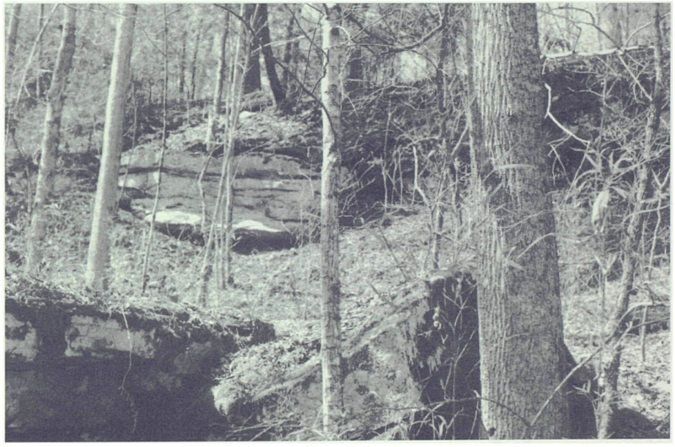
Figure 9. Rock outcrop (background) and colluvial blocks (foreground) characteristic of mid-elevation, transitional forest habitat above 370m.