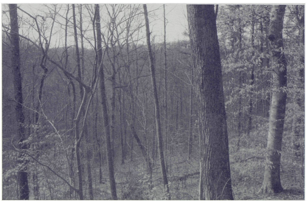
Figure 8. Mid-elevation, transitional habitat above Coles Fork showing deciduous hardwood tree species of American beech oaks, maples, hickories, and yellow-poplar.