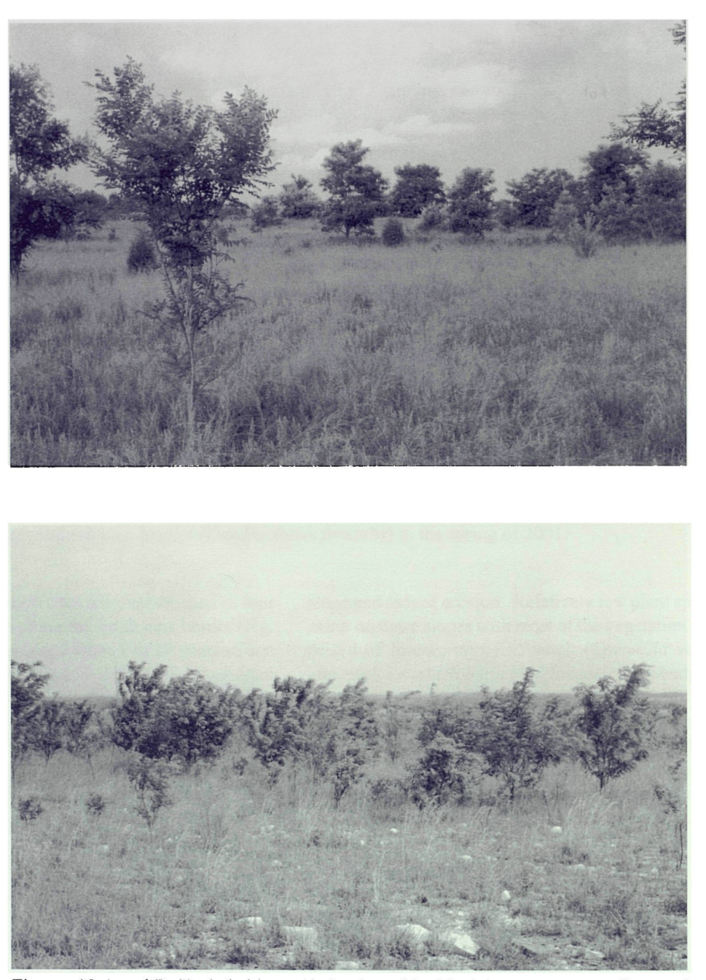
Figures 13 A and B. Xeric habitat: A) dominated by black locust, autumn olive, and dense stands of exotic lesbedeza on reclaimed surface mines; and B) a section of this habitat with soil comprised of compact rock rubble.