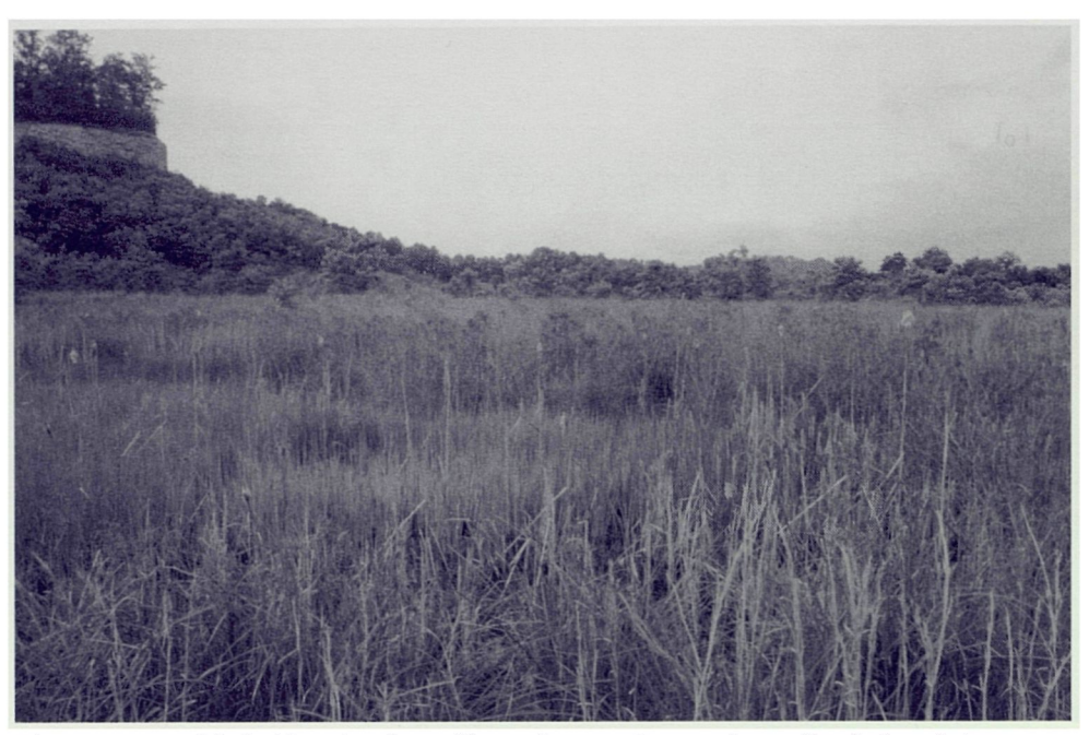
Figure 15. Hydric habitat dominated by sedges, rushes, and cattailes in low-lying areas of reclaimed surface mines. High wall in background is the northern boundary of Robinson Forest.