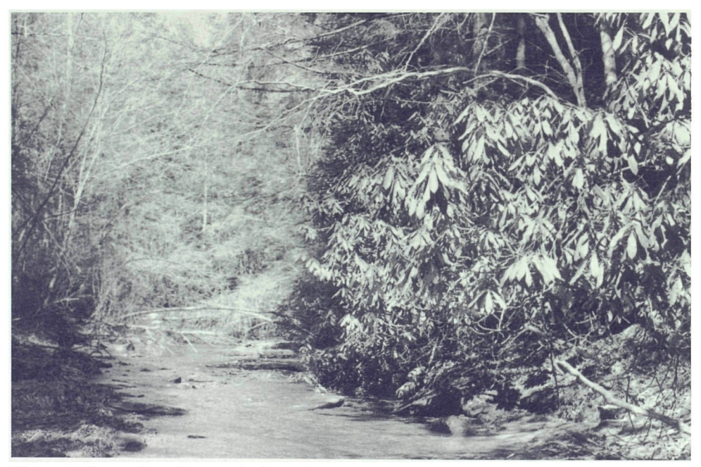
Figure 7. Low-elevation mesic forest habitat along Clemons Fork. Rosebay rhododendron is seen growing on the north-facing slope (right side of stream).