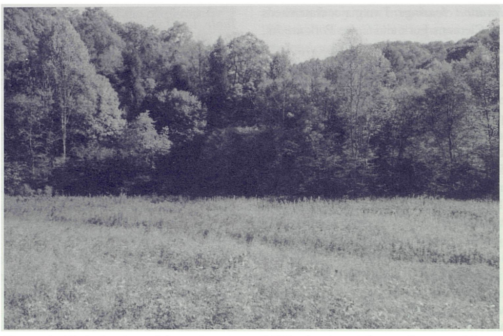
Figure 4. Herb-dominated, low-elevation wildlife clearing at the confluence of Snag Ridge Fork and Coles Fork.

logical studies. Typically, grasses are planted to prevent erosion along with various tree saplings (Appendix II). A series of successional plant communities occur until the area becomes forested. A 2-ha clearing was present during the study. It was cleared in 1989 and was three years old at the beginning of our study. It was located on a ridge top overlooking Bucklick Hollow and Coles Fork (Fig. 1). The elevation ranged from 320 to 430 m. This clearing was isolated from the nearest low-elevation clearings by 6 km of forest. For the first six years, a dense stand of broom-sedge (Andropogon virginicus) dominated the site. Bramble and 1-m tall tree saplings were dispersed through the grass (Appendix II). Of the saplings, Virginia pine (Pinus virginiana) and white pine (P. strobus) were planted, while others occurred naturally. By 2001, 4m tall trees dominated the site and little grass remained.