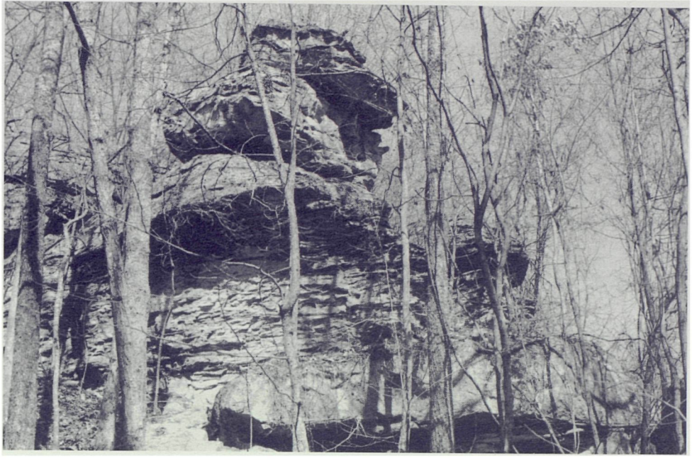
Figure 11. Capstone formations above Roaring Fork (see Figure 1) made of sandstone characteristic of ridge tops.