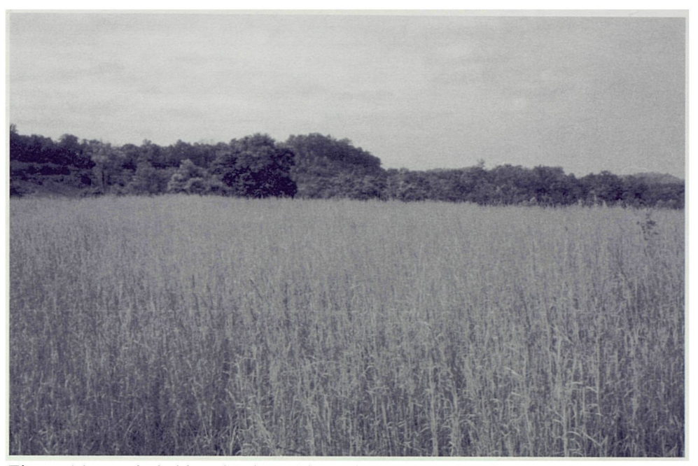
Figure 14. Xeric habitat dominated by a dense stand of grass on reclaimed surface mines on the northern boundary of Robinson Forest.