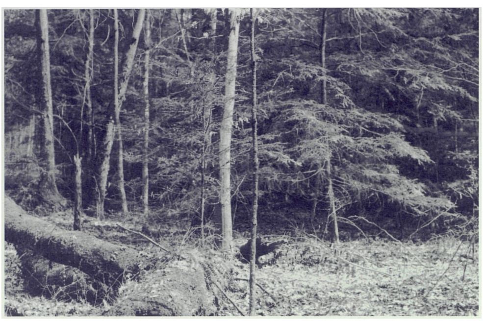
Figure 6. Low-elevation mesic forest habitat along Clemons Fork showing moss covered logs. Eastern hemlock and American beech are in the background.