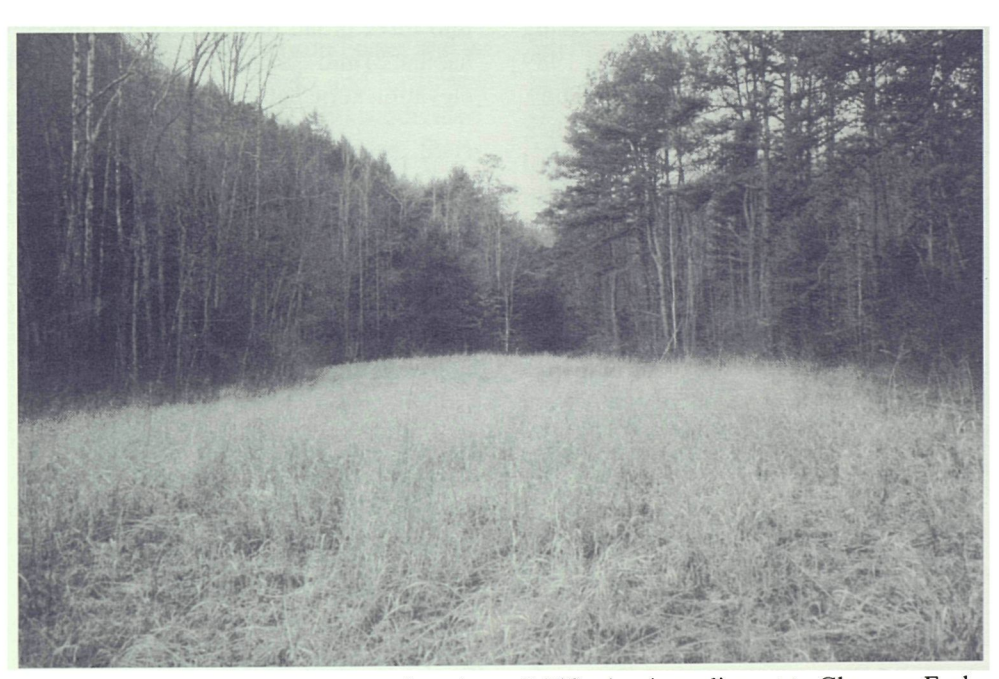
Figure 3. Grass-dominated, low-elevation wildlife clearing adjacent to Clemons Fork.