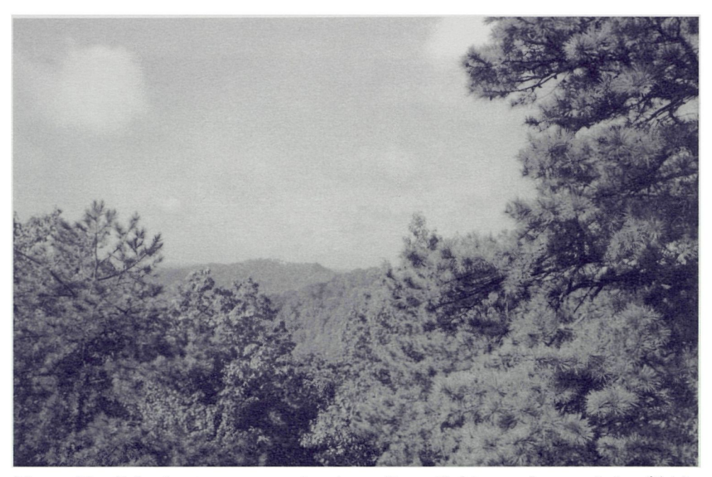
Figure 10. Oak-pine tree community above Camp Robinson characteristic of highelevation xeric habitat. The shortleaf pine and Virginia pine in the foreground were killed by southern pine beetles ( Dendroctonus frontalis ) in the spring of 2001.

Five mammal collection sites were established in four of the many habitats along the northwest border (Fig. 1). Reclaimed sites ranged from 1 to 20 years of age since last mined. The sampled habitats range from hydric to xeric conditions and from sparsely to densely vegetated. Many species of nitrogen-fixing legumes were planted over most of the reclaimed area. The soils of all collection sites lacked organic-rich topsoil. Instead soils are compact and comprised of shale, sandstone and coal ranging in size from course gravel to fist-sized rocks (Figure 13 b ).