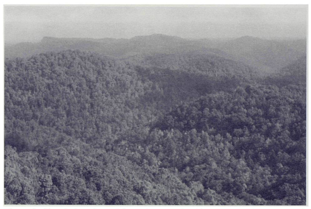
Figure 5. East-facing view of the main tract of Robinson Forest showing mixedmesophytic forest. A high wall and associated surface mining activity appears in the background of the upper, left-hand. This is the surface mined area above Millseat Branch as shown in Figure 1.

The mid-elevation transitional forest occurs at elevations ranging from 325 m to 375 m. This habitat is typical of the steep slopes of Robinson Forest and is dominated by multiple species of oaks and hickories (Figure 8, Appendix II). Overstreet (1989) subdivided this habitat into three forest community groups. Starting from the lowest elevation, these include: 1) the white oak species group dominated by white oak (Quercus alba); 2) the mixed oak-hickory species group dominated by a variety of oaks and hickories such as black oak (Q. velutina), pignut hickory (Carva glabra), and mockernut hickory (C. tomentosa); and 3) the transitional species group mostly dominated by black oak and chestnut oak (Q. prinus). Cooler and wetter north-facing slopes occasionally have stands of rosebay rhododendron, while warmer and drier south-facing slopes often have stands of blueberries (Vaccinium sp.). Blueberries are especially abundant where recent fire has occurred. Rock outcrops and colluvial blocks (large rocks that have broken away from capstones and outcrops that are slowly moving down the slopes) are scattered throughout the midelevation forest (Figure 9).