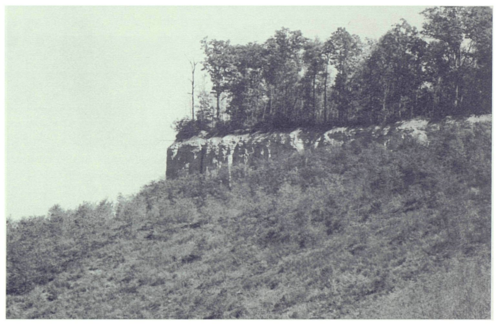
Figure 12. Slope with young black locust and tall fescue characteristic of reclaimed surface mines on the north-west boundary of Robinson Forest above Lewis Fork.