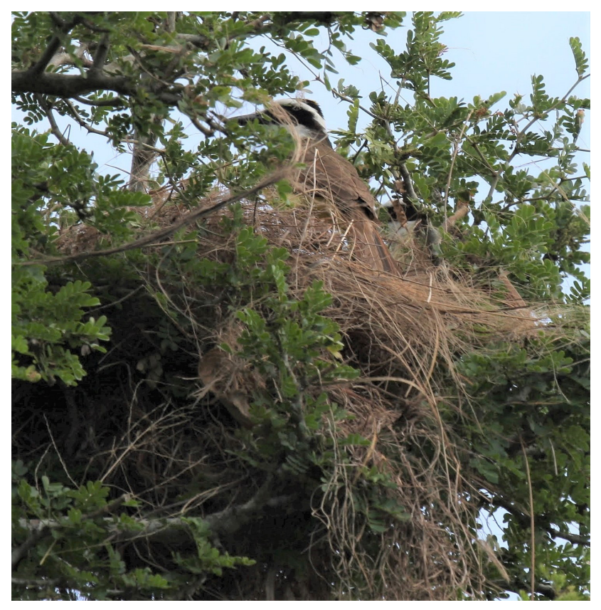
Figure 3. Nest of Pitangus sulphuratus at Inn at Chachalaca Bend, 6 May 2011.

female, USNM 646390 collected on 6 May 2011, had a convoluted oviduct and enlarged follicle of 6 mm. Most males had enlarged testes, but cloacal protuberance still small. Table 5 shows measurements of kingbirds collected.