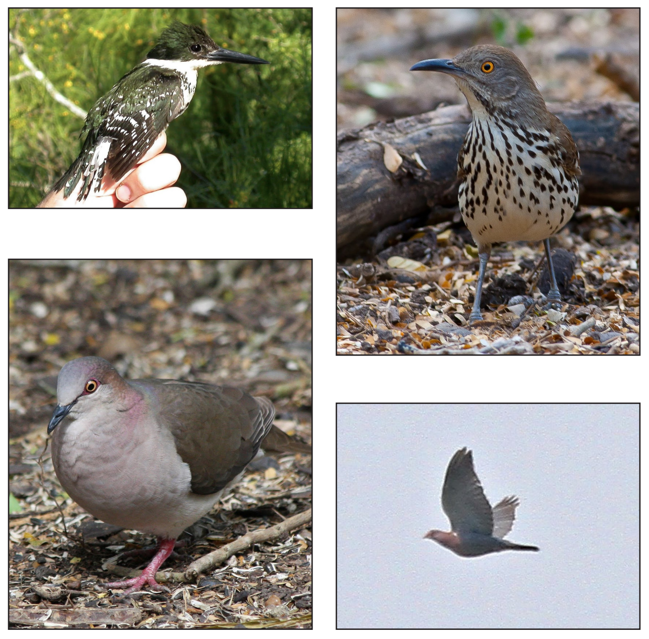
Top left, Green Kingfisher. Top right, Long-billed Thrasher. Bottom left, White-tipped Dove. Bottom right, Redbilled pigeon.