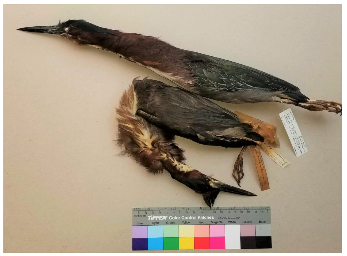
Figure 2. Upper specimen is Butorides virescens , WFB 11120, collected on 4 May 2011; lower specimen of Butorides virescens , USNM 4154, was collected from Brownsville in 1865.