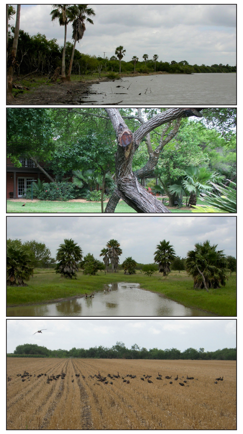
Habitats of Resaca de las Antonias. From top to bottom: Resaca forest and edge (2005); gradens (2008), restored oxbow and savanna (2008), and agricultural fields (2011).

Photographs of habitats, participants, and additional species.