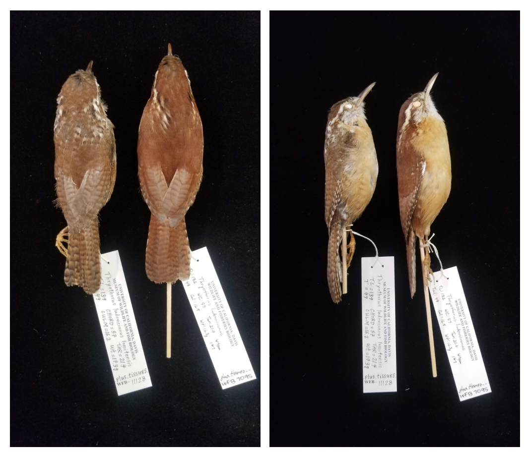
Figure 4. Photos comparing Thryomanes ludovicianus lomitensis (left specimen in each photo) with nominate Thryomanes l. ludovicianus (right specimen in each photo), showing brown-gray tones on upperparts and wings, bolder tail bars, and stronger facial patterning on lomitensis .

Diagnosis. —Many features separating subspecies of Veery are clinal and difficult to assess on one specimen. This specimen compared well with USNM specimens of C. f. fuscescens. Catharus f. levyi could not be ruled out due to poorly defined plumage traits (Pyle 1997). Therefore, it is referred to nominate C. f. fuscescens.