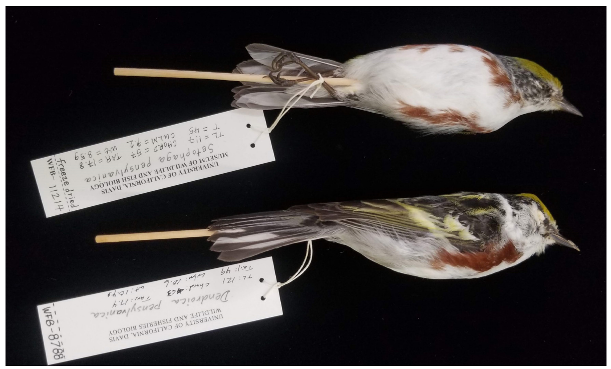
Figure 6. Aberrant Chestnut-sided Warbler (top; WFB 11214) collected 4 May 2011along Resaca de las Antonias compared to typical male (bottom). Note the black auricular and face of the aberrant bird.

comm.) suggested, "the blackish cheeks are simply an expression of hypermelanism in those feather tracts". Most birds had moderate to heavy fat loads and were non-reproductive. Several were netted and released.