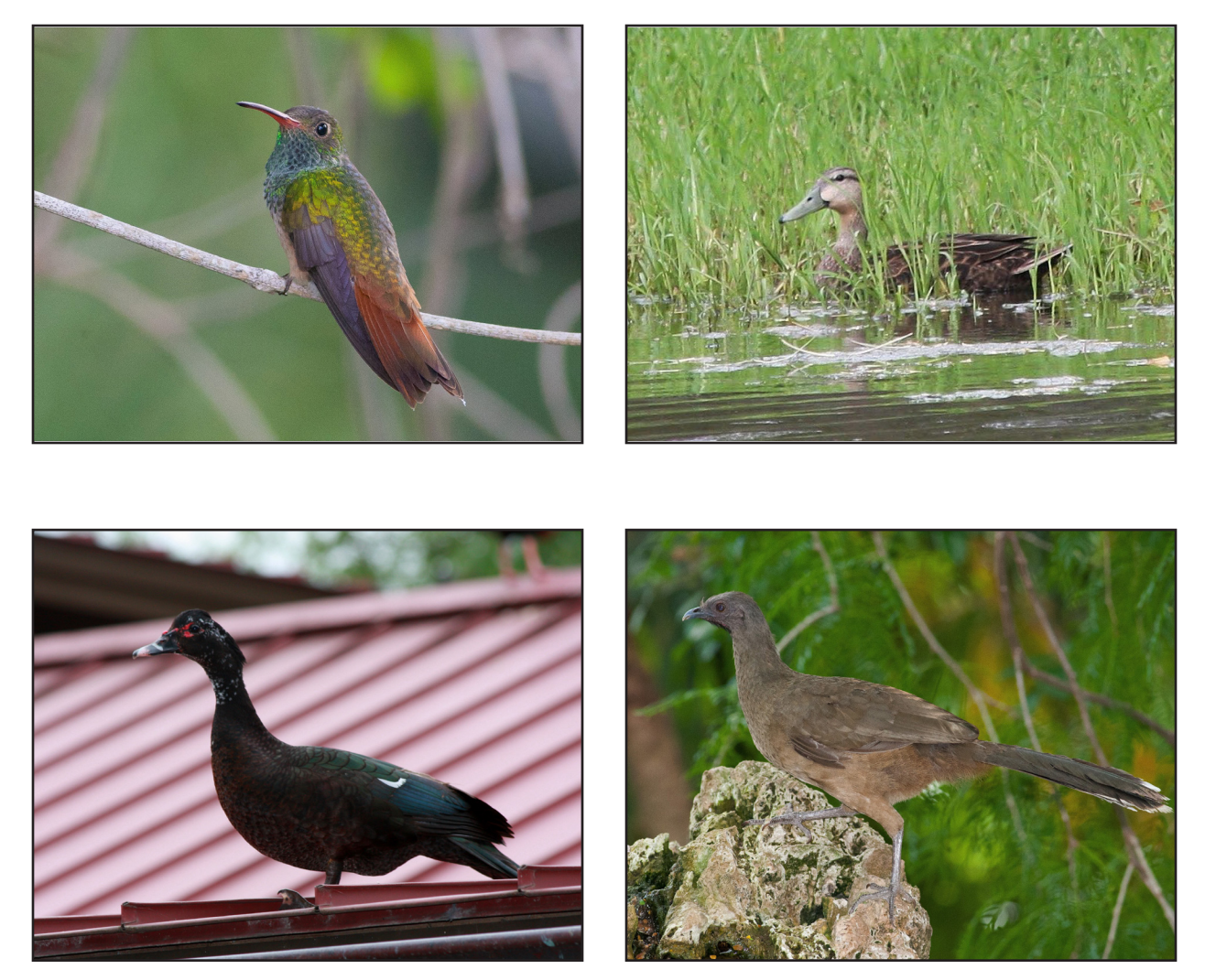
Top left, Buff-bellied Humminbird. Top right, Mottled Duck. Bottom left, Muscovy Duck. Bottom right, Plain Chachalaca.