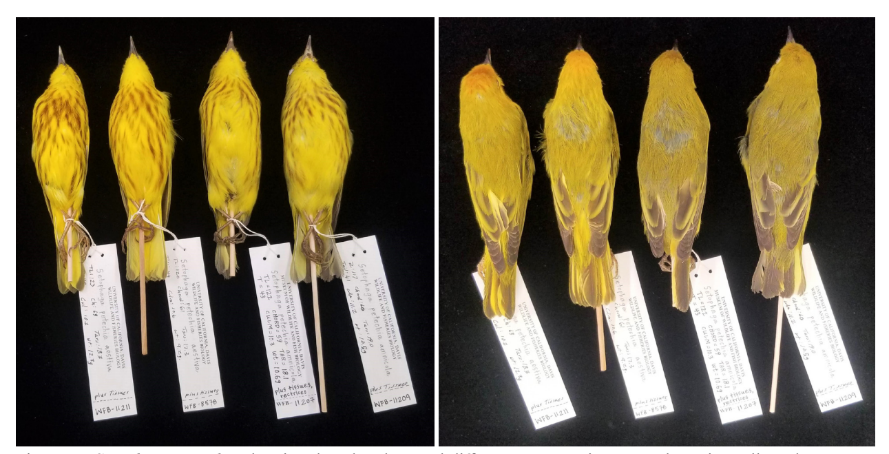
Figure 5. Setophaga petechia showing dorsal and ventral differences separating two subspecies collected at Resaca de las Antonias; brighter S. p. aestiva (left two) versus duller S. p. amnicola (right two). Note intensity of red and yellower head with reddish wash on aestivia , compared to more uniform greenish wash to head and back and fine red streaks on lemon yellow underparts of amnicola .

Remarks. —Common migrant in subtropical thorn forest, gardens and orchards. Specimen WFB 11214 collected on 4 May 2011 was an aberrant specimen (Fig. 6). Its dark cheeks are inconsistent with Chestnutsided Warbler in any plumage. Images of the specimen were sent to several ornithologists and all agreed that it lacked any real evidence of being a hybrid and is an aberrant individual. Kimball Garrett (LACM, pers