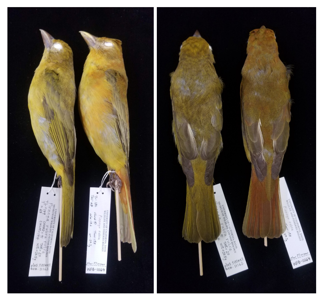
Figure 7. Variation of red in plumage of female Summer Tanagers collected at Resaca de las Antonias.

Specimens examined (7). —Male: WFB 5874, 6646, 11167, USNM 646475; female: WFB 8608, 11168, USNM 646177.