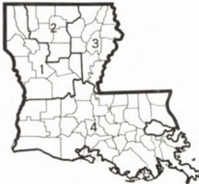
COTTON GRADE AND STAPLE DISTRICTS OF LOUISIANA