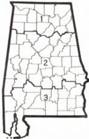
COTTON GRADE AND STAPLE DISTRICTS OF ALABAMA