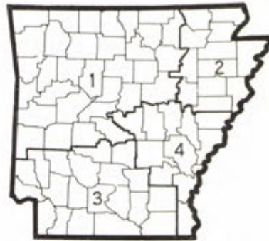
COTTON GRADE AND STAPLE DISTRICTS OF ARKANSAS