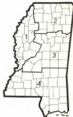
COTTON GRADE AND STAPLE DISTRICTS OF MISSISSIPPI