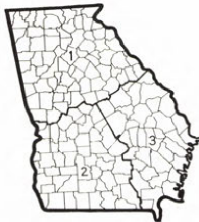
COTTON GRADE AND STAPLE DISTRICTS OF GEORGIA