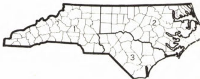
COTTON GRADE AND STAPLE DISTRICTS OF NORTH CAROLINA