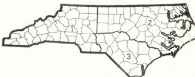
COTTON GRADE AND STAPLE DISTRICTS OF NORTH CAROLINA