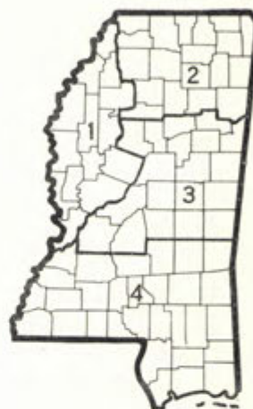
COTTON GRADE AND STAPLE DISTRICTS OF MISSISSIPPI