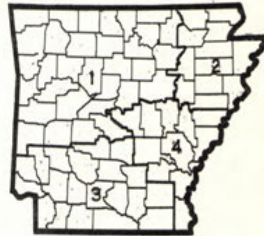
COTTON GRADE AND STAPLE DISTRICTS OF ARKANSAS