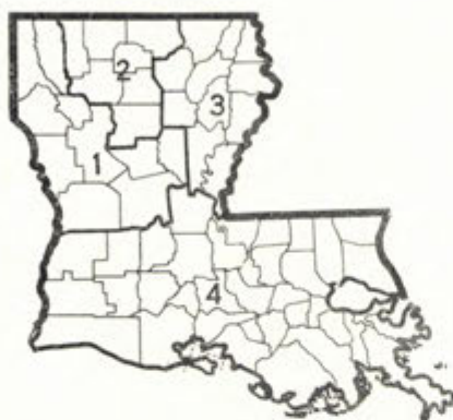
COTTON GRADE AND STAPLE DISTRICTS OF LOUISIANA