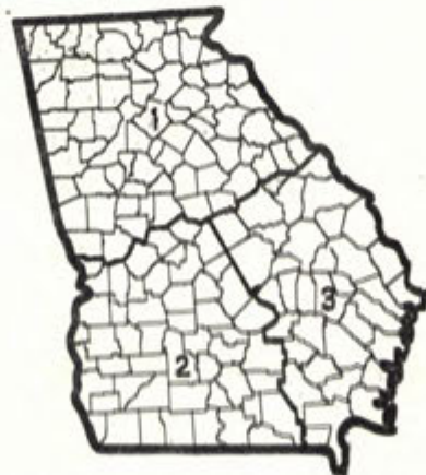
COTTON GRADE AND STAPLE DISTRICTS OF GEORGIA