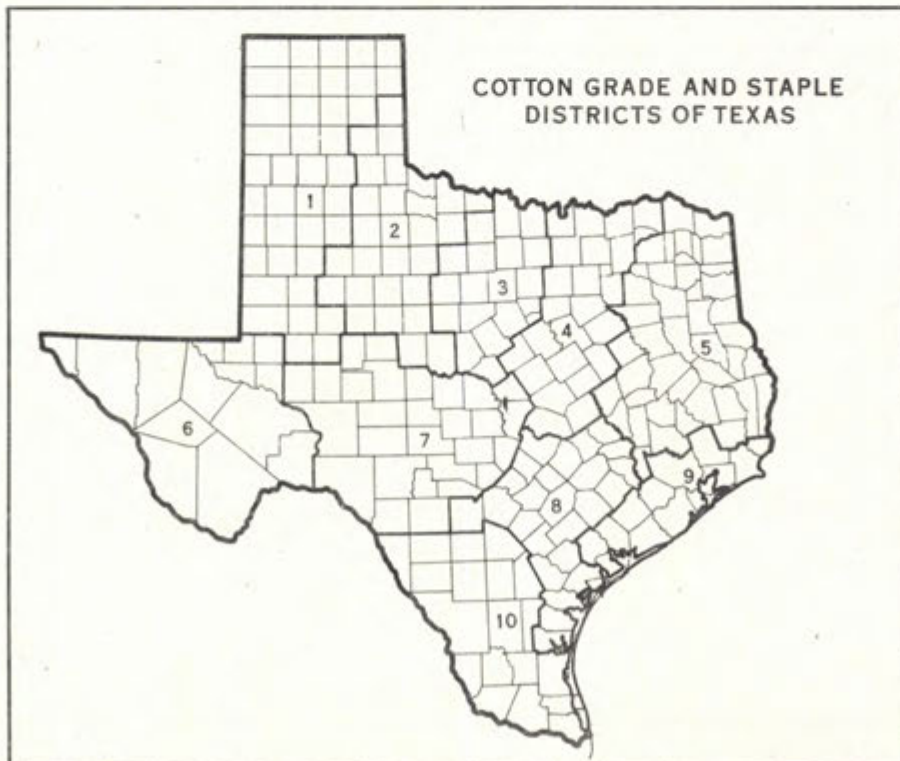
U. S. DEPARTMENT OF AGRICULTURE FIGURE 4 NEG. 512 AGRICULTURAL MARKETING ADMINISTRATION