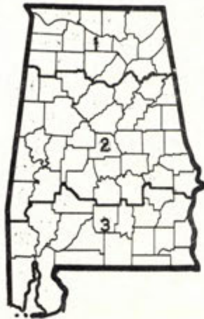
COTTON GRADE AND STAPLE DISTRICTS OF ALABAMA