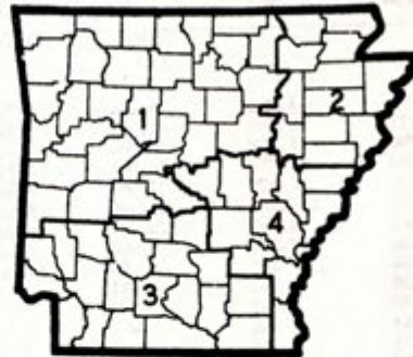
COTTON GRADE AND STAPLE DISTRICTS OF ARKANSAS