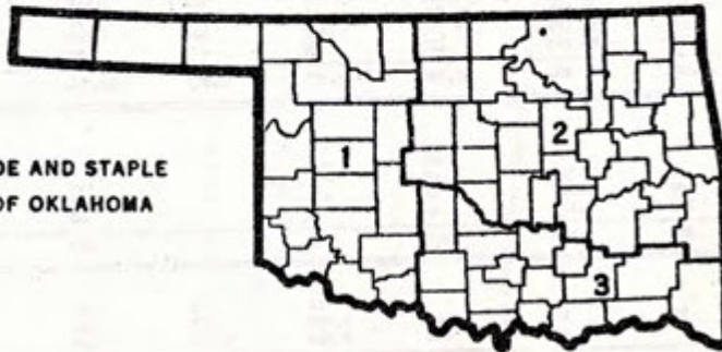
COTTON GRADE AND STAPLE DISTRICTS OF OKLAHOMA