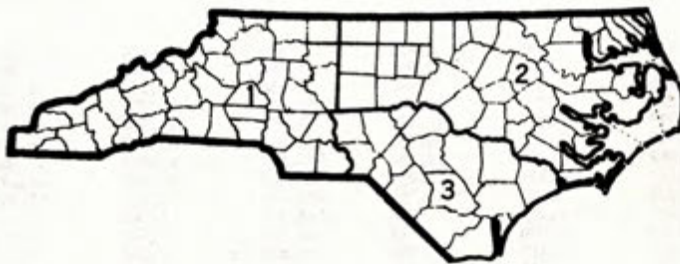
COTTON GRADE AND STAPLE DISTRICTS OF NORTH CAROLINA