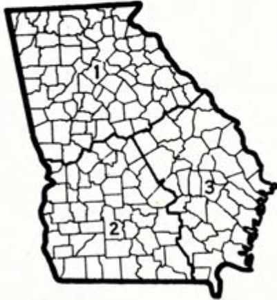
COTTON GRADE AND STAPLE DISTRICTS OF GEORGIA