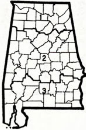
COTTON GRADE AND STAPLE DISTRICTS OF ALABAMA