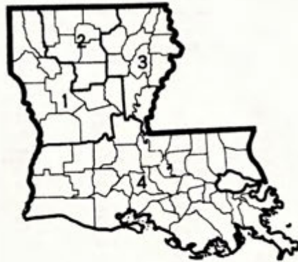
COTTON GRADE AND STAPLE DISTRICTS OF LOUISIANA