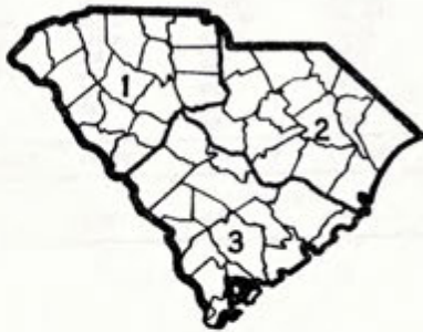
COTTON GRADE AND STAPLE DISTRICTS OF SOUTH CAROLINA