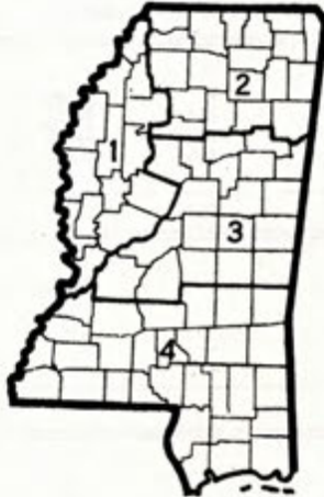
COTTON GRADE AND STAPLE DISTRICTS OF MISSISSIPPI