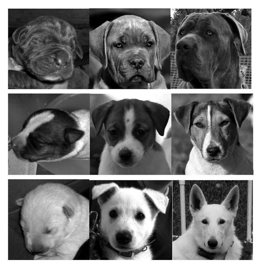
Figure 1. Sample images presented to participants. The center column shows, for each breed, the most attractive image. In the case of the Cane Corsos, this is the six-week-old pup; for the Jack Russells, the seven-week-old pup; and for the White Shepherds, the eight-week-old pup. The left column shows the least attractive image younger than the most attractive (in all cases, the zero-week-old pups), and the least attractive image older than the most attractive is in the right column (in all cases the seven-month-old dogs). Top row: Cane Corso; middle row: Jack Russell Terrier; and bottom row: White Shepherd.