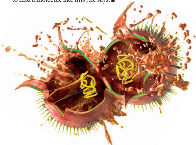
The antibiotic teixobactin (yellow) disrupts cell-wall formation in Gram-positive bacteria, leading to their rupture during cell division.