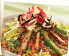
SANTA FE SALAD