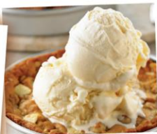
BJ'S FAMOUS PIZOOKIE®

EVEN MORE REASONS TO SAY – “Wow – I love this place!” ®