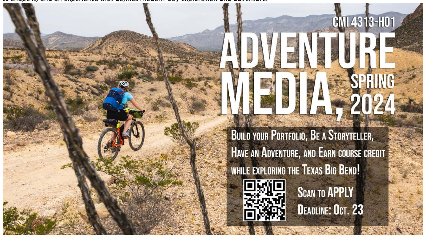
FULFILLS THE HONORS 4000-LEVEL SEMINAR REQUIREMENT

Humankind desires it, literature and journalism document and create a sense of it, and multi-million dollar industries promote it: ADVENTURE! This unique course offers you creative, critical, practical, and strategic insight and experience in analyzing and producing media centered around the concept and popularized notion of adventure by placing you in the middle of it! The course's primary learning and application takes place across several Saturdays, over one full weekend, and during an intensive Spring Break outdoor lab while bikepacking and producing documentary and travel media in Big Bend Ranch State Park, a land steeped in the history and culture of the southwest, is geologically and geographically unique, and prime for outdoor active travel and lifestyle. You will engage in various hands-on, creative media storytelling practices that communicate the natural world, a culture that continues to shape it, and an experience that defines modern-day exploration and adventure.