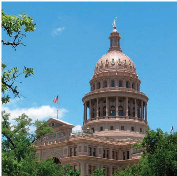
ON THE COVER Making Texas history in the state Capitol pg. 15