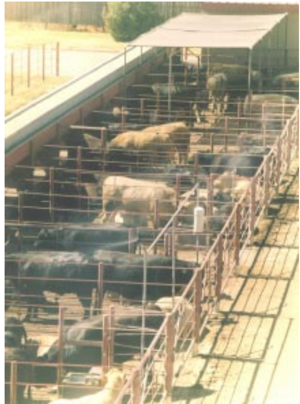
Figure 1: Sprinkle, mist, and shade treatments (front to back) in Exp. 2.

physiology of feedlot cattle during two summers.