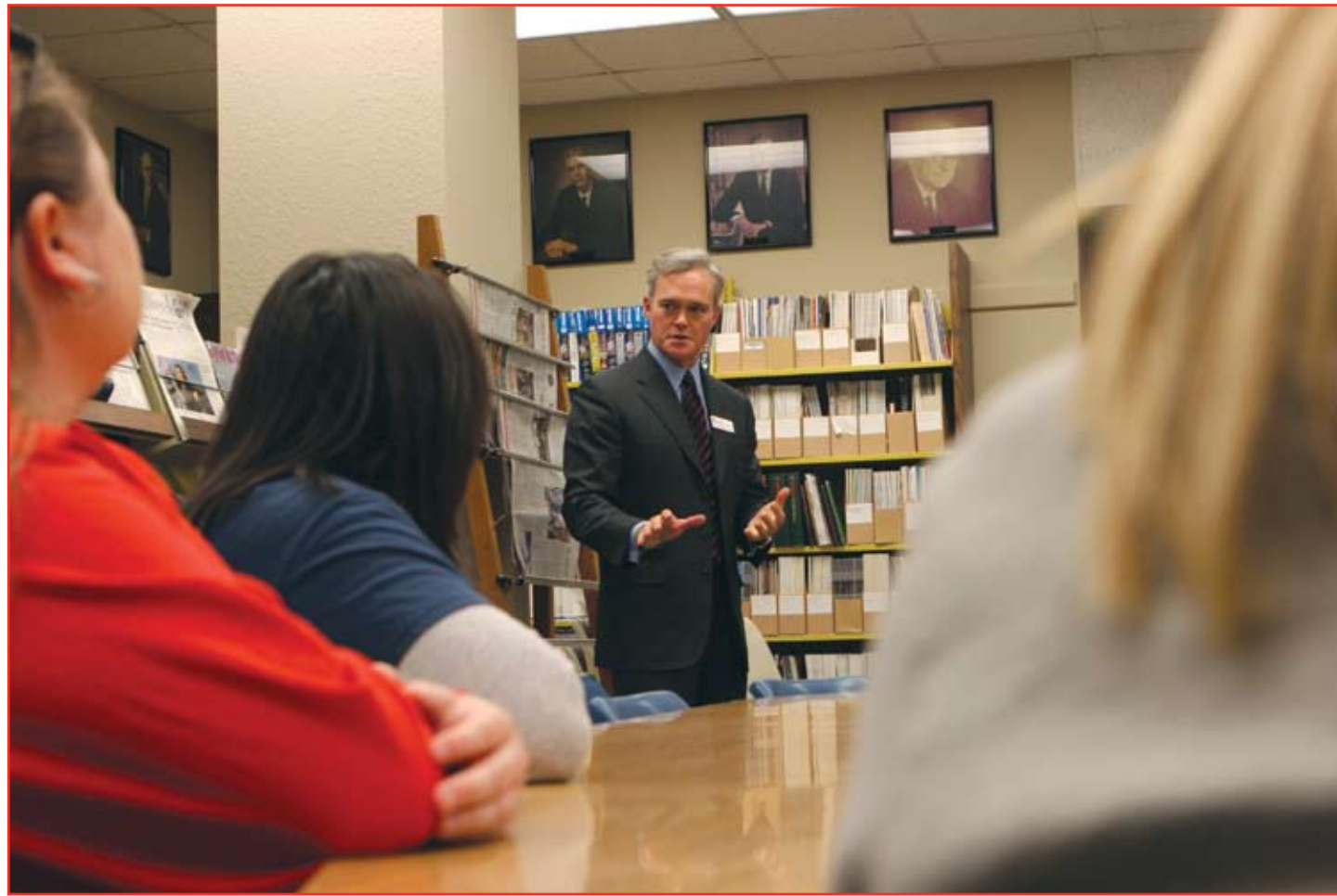
Scott Pelley talking with students in the Mass Communications library before the Hall of Fame luncheon.

it is their responsibility to always speak up if they feel there is something unethical or inappropriate occurring. When you sense that something isn't right, he said, scream at the top of your lungs. Don't let the train wreck happen.