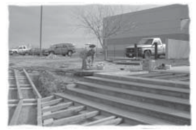
Blake Morris attaches decking material onto the concrete trailhead base for the wildflower trail.

Other outdoor improvements taking place around the Landmark are new flower beds, reworking old trails, brush management, and fence boundary improvements. In addition to a planter bed going up inside the new trail head, another currently is being constructed in back of of the Nash Interpretive Center Building. It too will be constructed of natural limestone and will display some native willow trees along with Southern High Plains wildflowers. The three and a half mile nature trail has been reworked (graded) for a fresher appearance and easier walking.