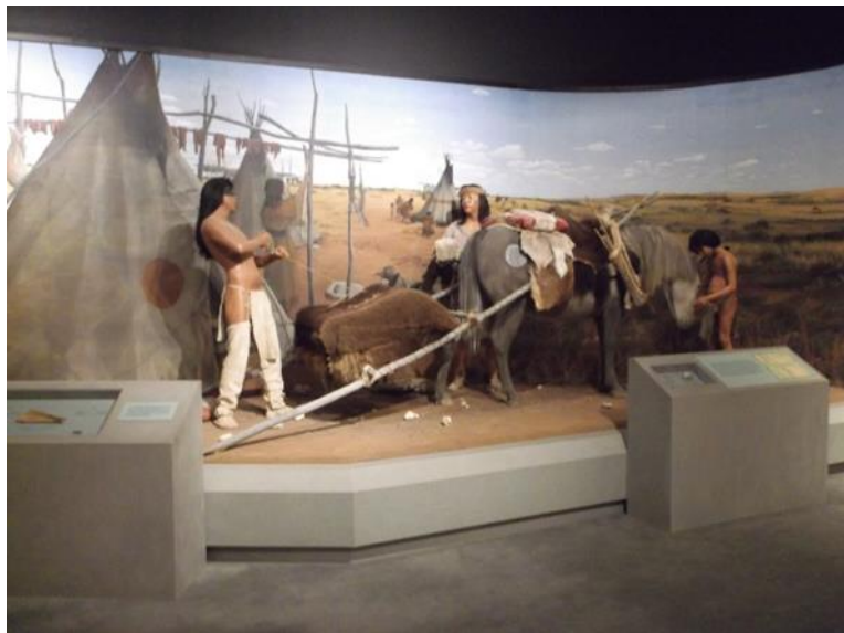
11. The new exhibit – A Misunderstood Landscape - traces the history of human interaction with the Plains, and introduces visitors to a prairie conservation effort called Prescribed Burning.