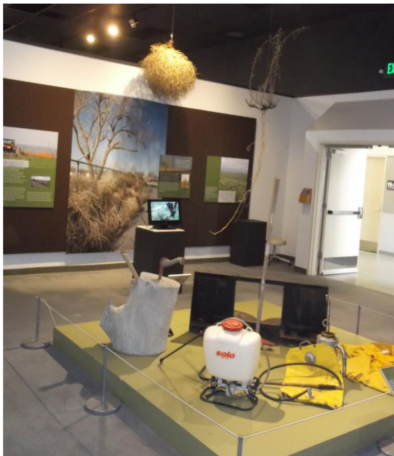
12. In the Learning Center, you can read books or work on a floor puzzle. Here you will meet the Landmark's educators, they will instruct you on the activities you can participate in during your visit today.