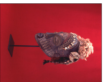
Shina Malulu Mask