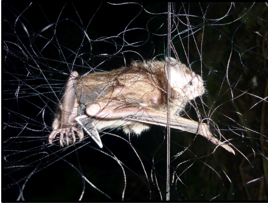
Vampire bat captured in a mist net.

Mist nets are used by bat biologists to harmlessly capture bats for research purposes. The nets are made of fine nylon or polyester mesh suspended between two poles. The size of the mesh varies depending on the size of the species targeted for capture.