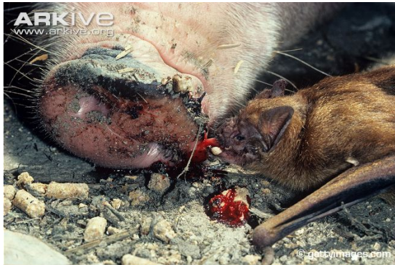
Desmodus rotundus feeding on blood from a pig's snout.

The Common Vampire Bat is one of the few species of bats that is considered an agricultural pest. Its pest status is due to its feeding on domestic livestock and spreading of disease, including rabies. Losses to the cattle industry due to rabies in Latin America amount to many millions of dollars every year.