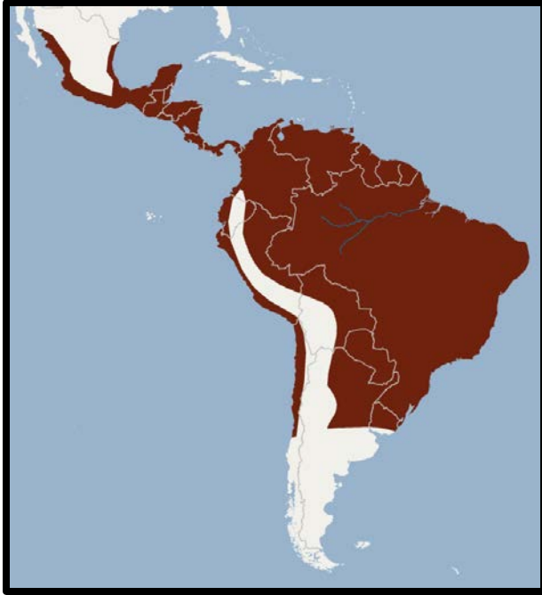
Distribution of the three species of vampire bats.

Three species of vampire bats are recognized. Vampire bats occur in warm climates in both arid and humid regions of Mexico, Central America, and South America.