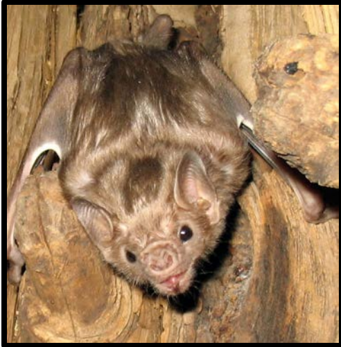
White-winged vampire bat, Diaemus youngi.

This species feeds mainly on the blood of birds. They occur from Mexico to southern Argentina and are present on the islands of Trinidad and Isla Margarita.