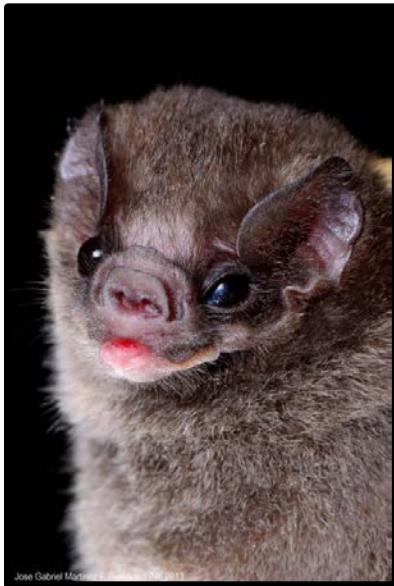
Hairy-legged vampire bat, Diphylla ecaudata.

This species also feeds mainly on the blood of birds. They occur from Mexico to Venezuela, Peru, Bolivia, and Brazil. One specimen was collected in 1967 from an abandoned railroad tunnel in Val Verde County, Texas. This specimen (now in the Museum's Mammal Collection of the Natural Science Research Lab) is the only record of a vampire bat ever documented from the United States.