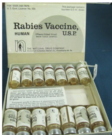
Human rabies vaccine.

Strategies to control rabies transmitted by vampire bats include vaccination of humans and livestock and reduction of bat populations by culling. Vaccination of livestock is effective, but is impractical and too costly in the developing countries where vampire bat rabies problems are most severe. For humans, vaccination also is cost-prohibitive for many people in these regions, and vaccination efforts typically are initiated only after a death is reported in an area.