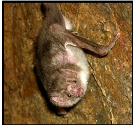
Common vampire bat, Desmodus rotundus.

This species is the most abundant and most well-known of the vampire bats. Desmodus feeds mainly on mammals, particularly livestock. They occur from northern Mexico southward through Central America and much of South America, to Uruguay, northern Argentina, and central Chile, and on the island of Trinidad in the West Indies.