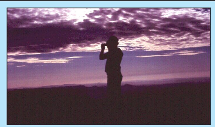
Looking for good students! Bradley in Davis Mountains, Texas.