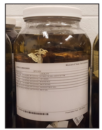
Updated spun-bound polyester labels listing specimens in jar and fluid type.