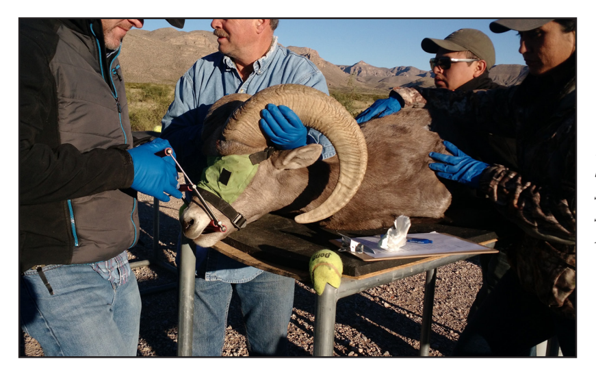
Texas Parks and Wildlife Department biologists and collaborators perform disease screening and monitoring of desert bighorn sheep during autumn 2016 in the Trans-Pecos region of Texas.

The NSRL is excited about these expanded research opportunities. Both of these projects are the result of recent renovations to the Genetic Resources Collection of the NSRL and installation of a liquid nitrogen storage system. Those improvements were made possible by NSF grant funding and support from Texas Tech University.