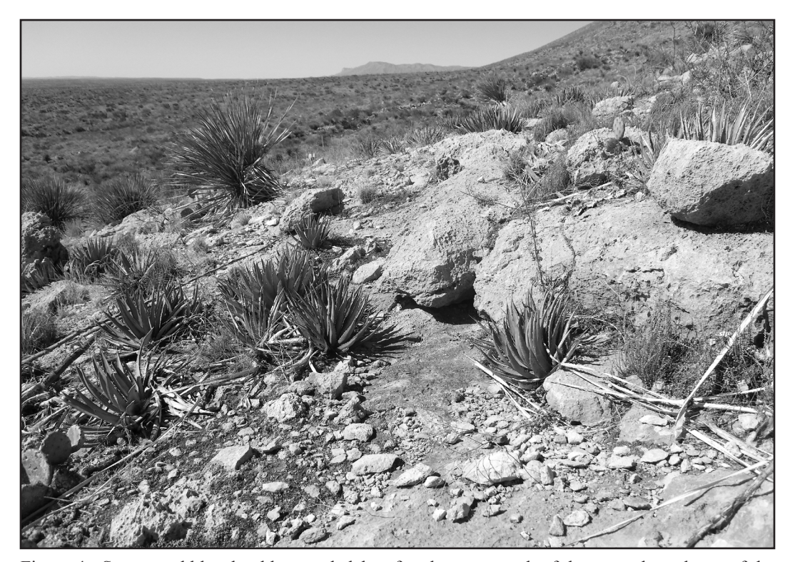
Figure 4. Stones, cobbles, boulders, and slabs of rock cover much of the ground on slopes of the eastern escarpment of the Guadalupe Mountains. Plants growing among the rocks in this view include Lechuguilla ( Agave lechuguilla ), Smooth Sotol ( Dasylirion leiophyllum ), prickly pear ( Opuntia ), and cloakfern ( Astrolepis ). This photograph was taken by KNG near the mouth of Slaughter Canyon in Carlsbad Caverns National Park, New Mexico, where a male Nelson's Pocket Mouse ( Chaetodipus nelsoni ) was captured and released on 12 and 13 March 2013. El Capitan and Guadalupe Peak in Guadalupe Mountains National Park, Texas, can be seen in the far distance (top center of photograph).