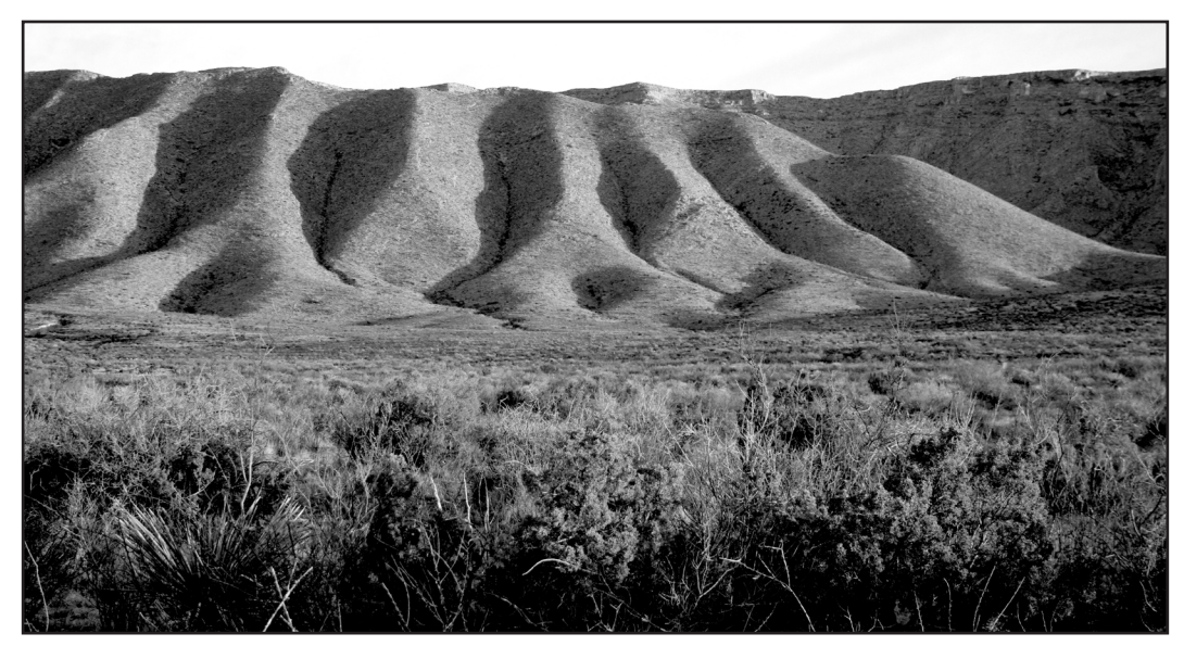
Figure 3. Face of the eastern escarpment of the Guadalupe Mountains, showing exposed slopes separated by gullies and ravines. The mouth of Yucca Canyon in Carlsbad Caverns National Park, New Mexico, is shown on the far right.