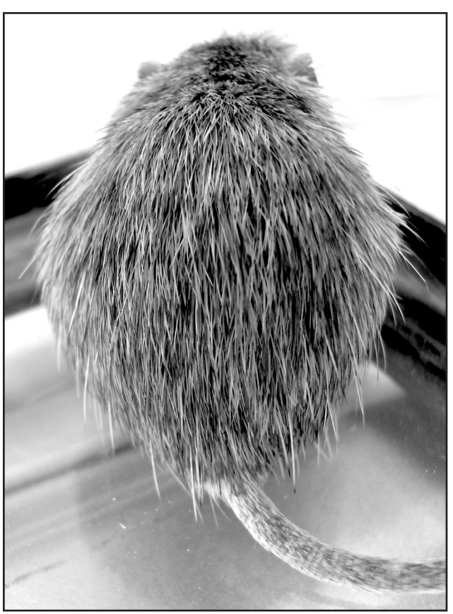
Figure 5. This male Nelson's Pocket Mouse ( Chaetodipus nelsoni ) was captured and released in the mouth of Sheep Draw, Guadalupe Mountains, New Mexico on 8 June 2013. Note the numerous and well-developed rump spines.

buquerque (MSB). Information from other specimens of C. nelsoni captured in the Guadalupe Mountains also was gathered, including specimens housed in natural history collections at Carlsbad Caverns National Park (CACA); the New Mexico Museum of Natural History, Albuquerque (NMMNH); and University of Kansas Museum of Natural History, Lawrence (KU; also see the species account of C. nelsoni in Geluso and Geluso 2004). In addition, unpublished information about C. nelsoni was incorporated from captures by G. J. Emmons (pers. comm.) in 2001 and D. J. Hafner (pers. comm.) in 2003 at Carlsbad Caverns National Park. Information on a specimen collected in the park in 1973 also was included; the specimen formerly was housed at the University of Illinois Museum of Natural History, Urbana (UIMNH 47270) but is presently at MSB (184756). Institutional abbreviations follow Hafner et al. (1997).