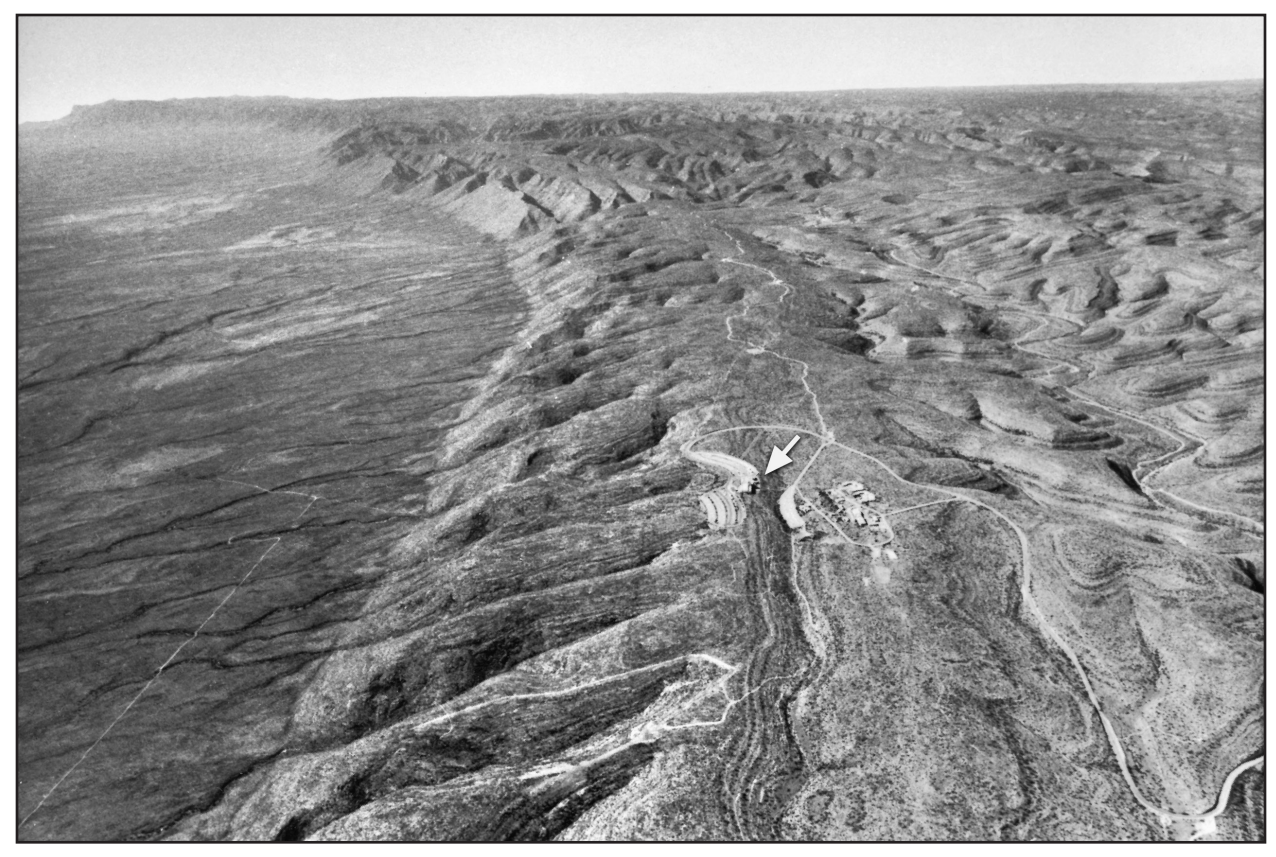
Figure 1. The Guadalupe Mountains of New Mexico and Texas stand above the surrounding plains. Where the flat landscape on the left side of the aerial photograph meets the base of the mountains represents the bottom edge of the eastern escarpment of the mountain range. The arrow points to the Visitor Center in Carlsbad Caverns National Park, New Mexico. El Capitan and Guadalupe Peak in Guadalupe Mountains National Park, Texas, can be seen in the extreme upper left-hand corner of the photograph. El Capitan (first prominent bump on left) is the southernmost bluff of the mountain range, and Guadalupe Peak (bump to the right of El Capitan) is the highest peak in Texas.

(Hill 1987), Guadalupe escarpment (Rice-Snow and Goodbar 2012), or simply the eastern escarpment of the Guadalupe Mountains.