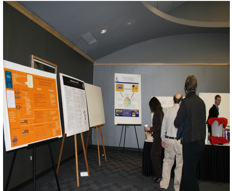
A poster session at CISER