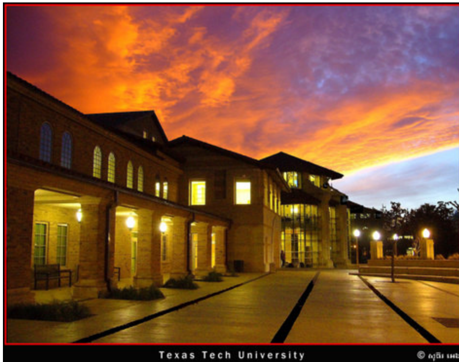
Texas Tech University