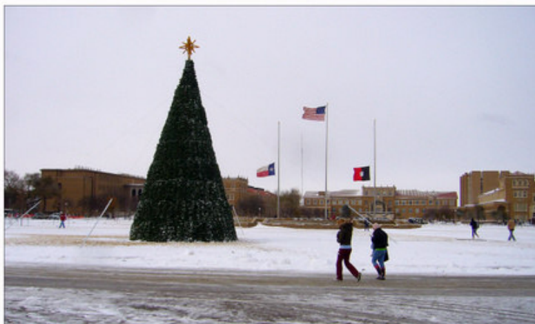
The Holiday Season in Lubbock

Feel free to email your suggestions to me at david.rudd@ttu.edu . I'll share any and all suggestions with both faculty and our graduate students. A vision for the future is only viable if it nurtures our core purpose!