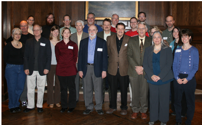
Attendees Gather for a Picture