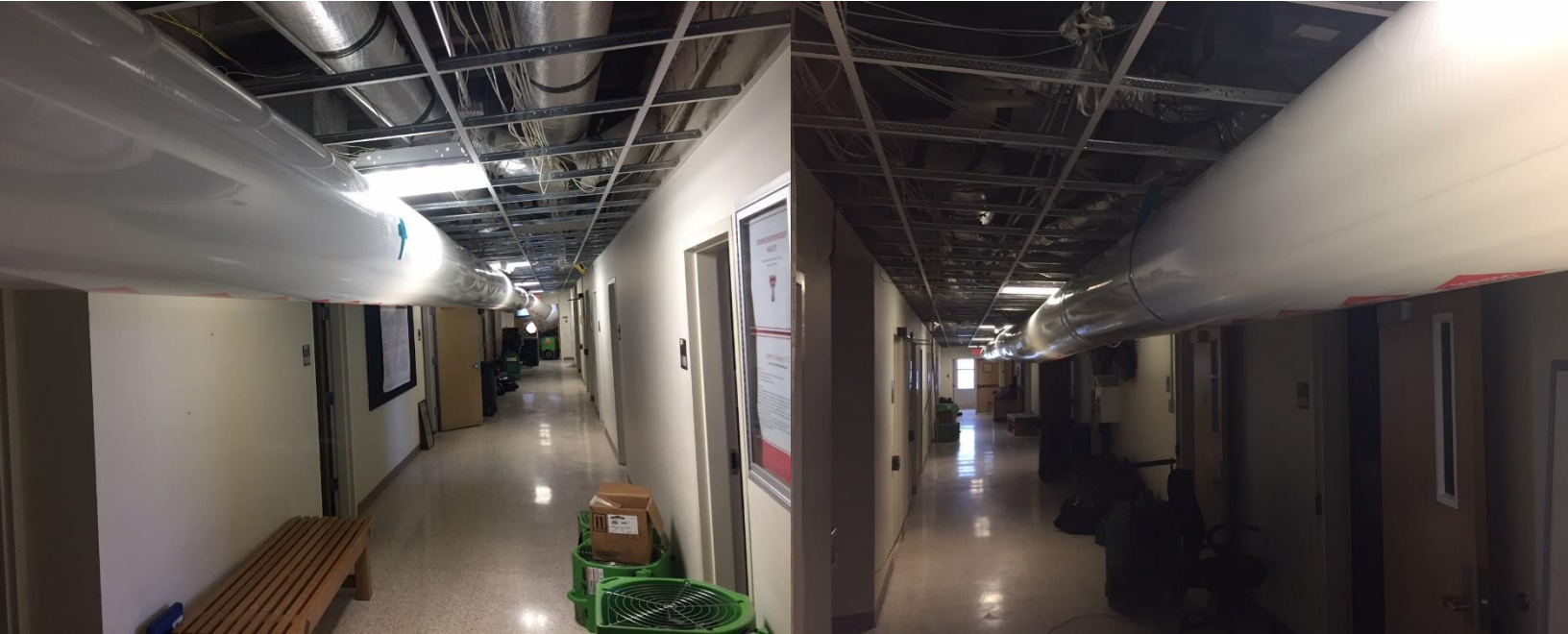
Hot air tunnels brought in for drying out.