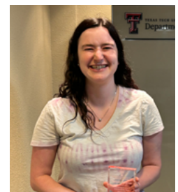
Hannah Snidman Undergraduate Course of the Year & Research in Diversity, Equity and Inclusion