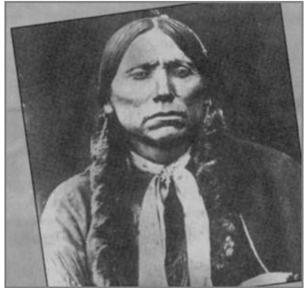
Last Comanche Chief Quanah Parker

Quanah Parker provided leadership to his people and promoted self-sufficiency and self-reliance. He fought fervently for peace and for his people as he did as a war chief. Quanah did not abandon his past or force his people to desert their traditions altogether. He considered himself a man who tried to do right to both the people of his tribe and to his “pale-faced friends.”