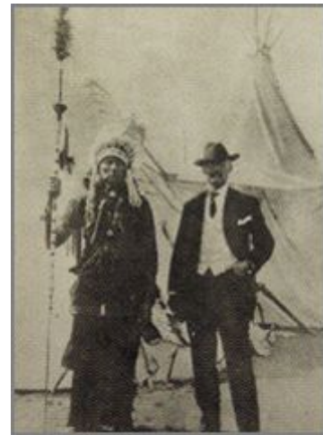
Quanah Parker and Burk Burnett

Quanah Parker provided his people with determined leadership. He led by example and promoted self-sufficiency and self-reliance. He fought fervently for peace for his people. As time passed on the reservation, Quanah served not only as chief of the Comanche but also as a sheriff and a tribal court judge. He lobbied against Congress and pleaded the cause of the Comanche Nation. Among his friends were cattlemen Charles Goodnight, Burk Burnett and President Theodore Roosevelt.