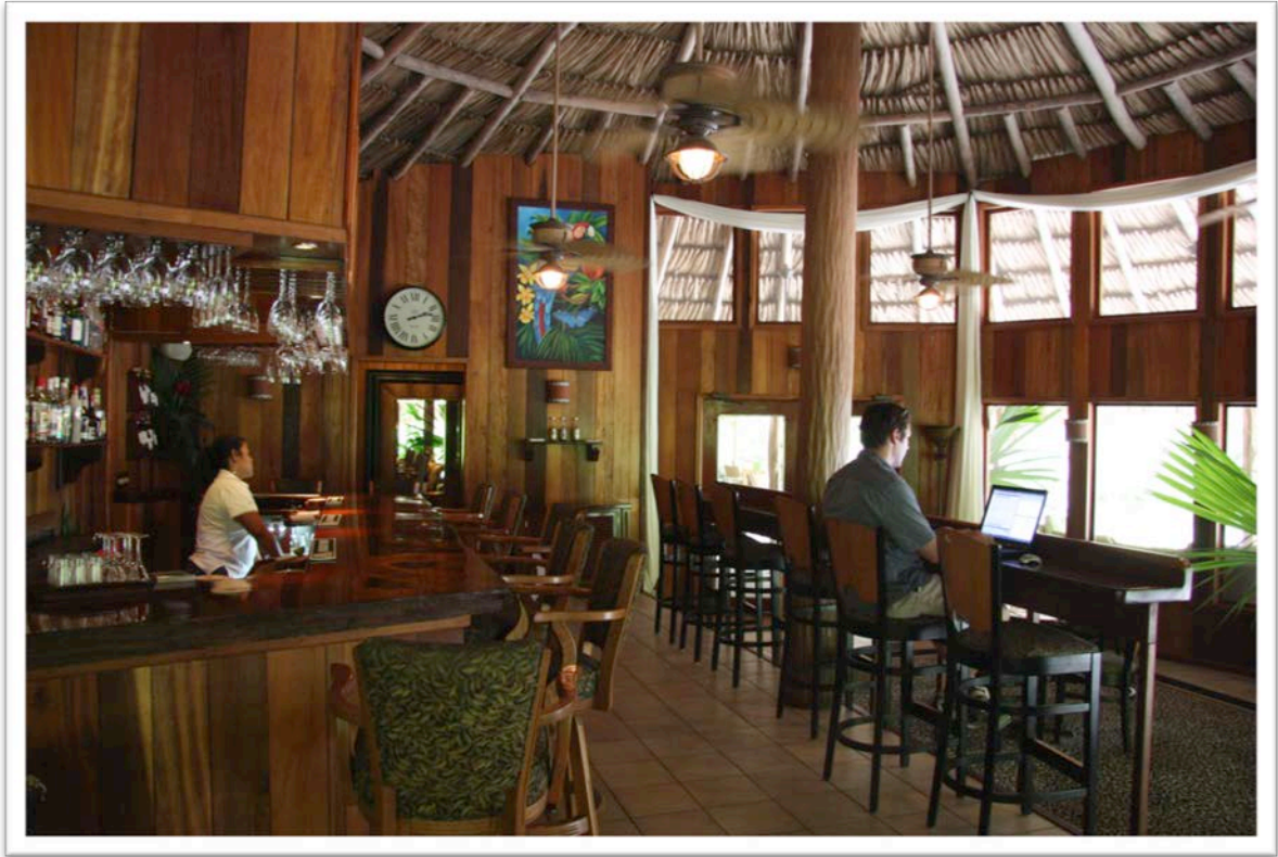
The Looter's Trench bar at Chan Chich Lodge.