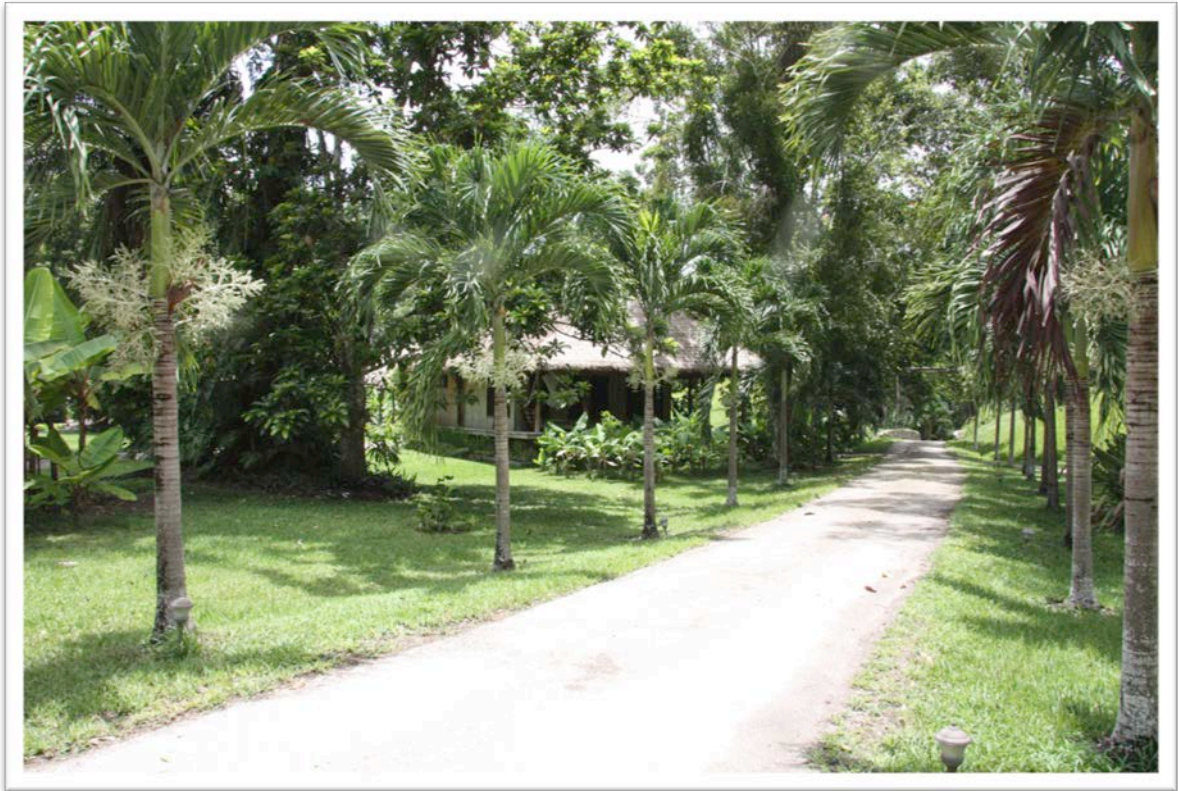
Main road entering Chan Chich Lodge and the main plaza of the archaeological site.