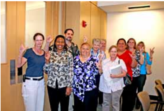
Texas Tech coordinators show their Tech pride at campaign coordinator training.

Thank you for supporting the Greater West Texas State Employee Charitable Campaign!