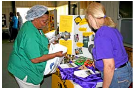
Employees at the Lubbock State Supported Living Center browse tables at their kickoff and agency fair.