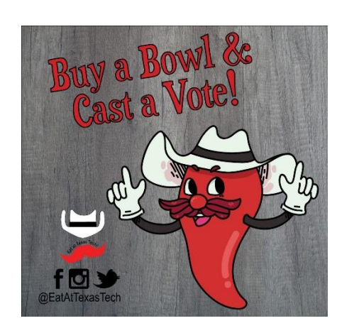
2020 Hospitality Services Chili Cook Off

Purchase a Commuter Dining Plan at this event and receive 10 extra Dining Bucks!