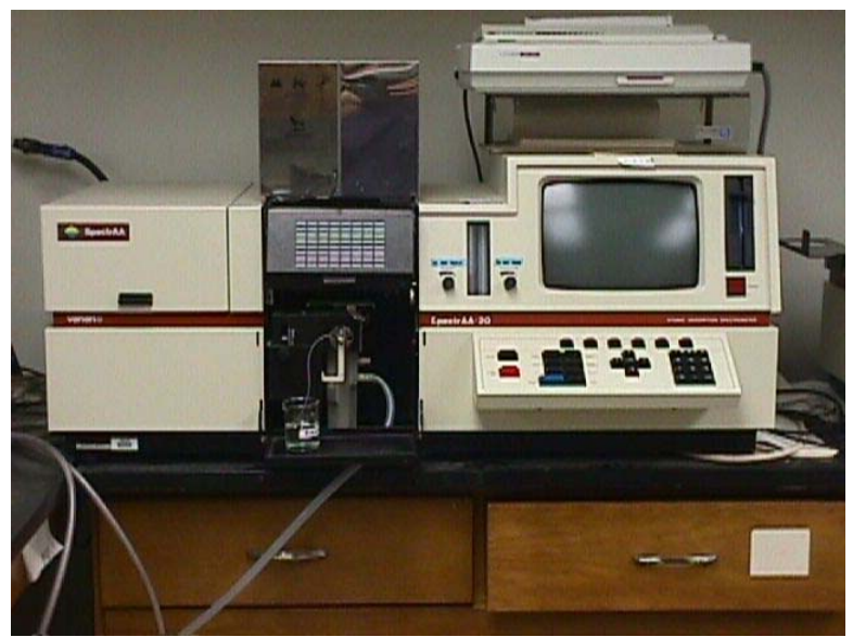
Figure 3. Flame Atomic Absorption Spectrometer

The machine detection limits were used to determine which machine would be appropriate to use to for testing each metal. The metals analyzed using direct-aspiration atomic absorption spectrometry were aluminum, barium, copper, manganese, silver, and zinc. Barium and aluminum required the addition of potassium chloride to the metal digestion (Method 3010) (US EPA, 1999) to reduce interferences from other metals in the sample. The resultant potassium chloride concentration was 2000 mg/L.