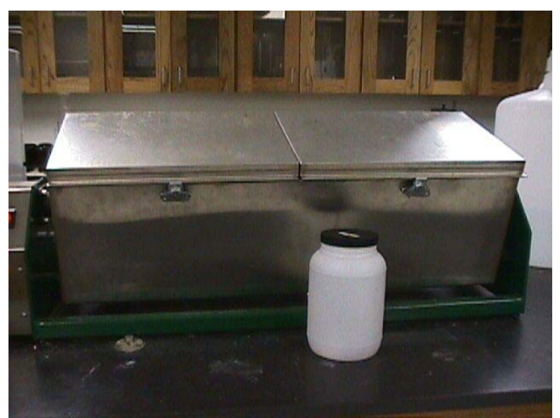
Figure 1. Extraction vessel and tumbler