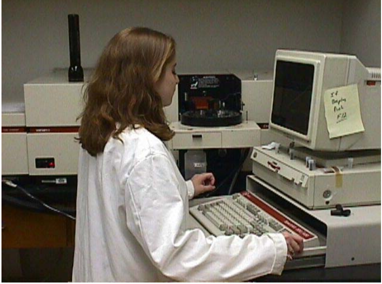
Figure 4. Graphite Furnace Atomic Absorption Spectrometer

The graphite furnace technique was used to determine the concentration of metals in liquids when low concentrations are necessary. A single standard was made that the autosampler uses to mix the calibration points. Samples were loaded into 2-mL sample cups in the autosampler. The autosampler extracts the sample and injects the sample into the graphite tube. Two graphite tubes, partition tube and the plateau tube, were used to perform the analysis and the type of tube used depends on the furnace parameters and method performed. In this project, the partition tube was used most frequently and the furnace parameters are set up to Varian's specifications. For cadmium and thallium, a plateau tube was used to because of difficulties from using the partition tube. For these metals, the furnace parameters were set up as described in a paper published by Varian (Beach, 1988) or their manual for graphite tube atomizers (Rothery, 1988).