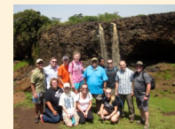
Study Abroad in Ethiopia