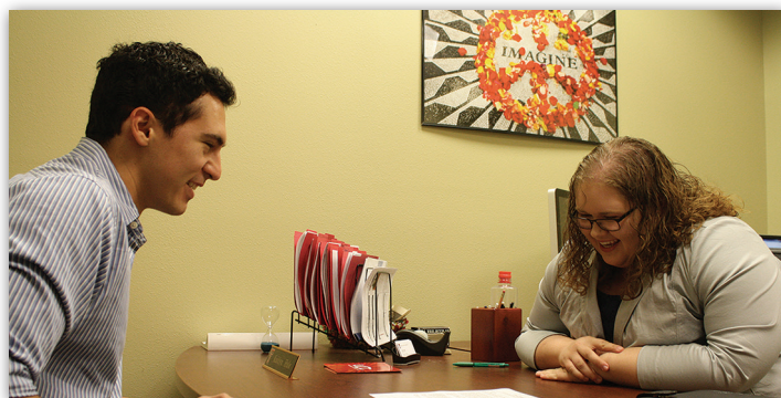
Hale and a student are all smiles as she critiques his cover letter