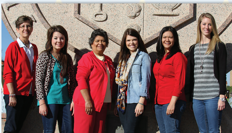
The ladies of the Dr. Bill Bennett Student Success Center

"My favorite part about working in the Student Success