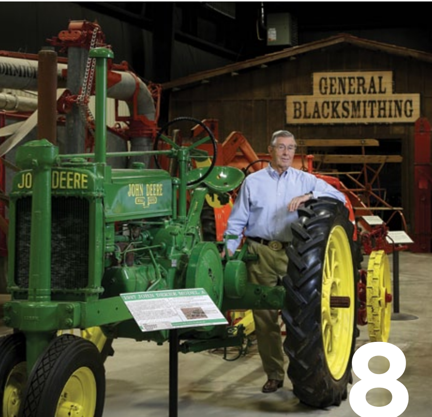
A Life Devoted to Education