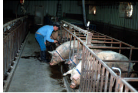
Neck tethered sows in gestation

The sow crate design is fairly uniform around the world. The feeder can be made of metal, but more often the sow feeder is concrete. Metal bars are at the front of the crate.