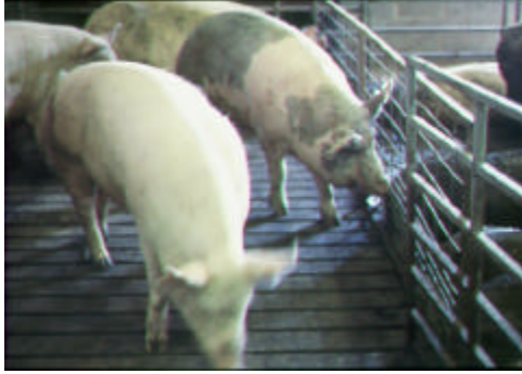
Indoor grouped sows on concrete slats