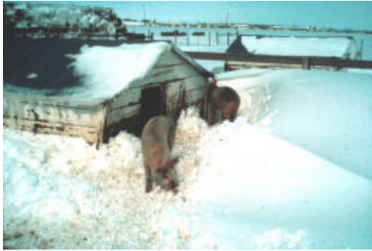
Outdoor sows in Wyoming