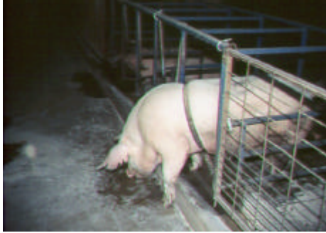
Girth tethered sows in gestation