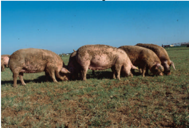
Outdoor sows on the Southern High Plains