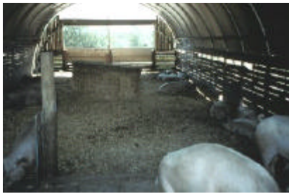
Inside a hoop (bedded building)

If sow welfare was the only factor in designing the crate, then crates would be much larger (perhaps twice the area or more). Once the decision is made to individually house sows to provide individual care, economics will determine the actual space that is provided. Economics drives the space allowance down while animal welfare considerations drive the space up. Furthermore, economics favors use of concrete slatted floors under crated sows rather than solid floor with bedding. Concrete flooring leads to foot lesions and shoulder lesions. Bedding would prevent some skin and limb lesions however removal of bedding and sanitation of a bedded crate is not considered practical by the industry, so the crate is more typically placed on a slatted floor surface rather than a bedded surface.