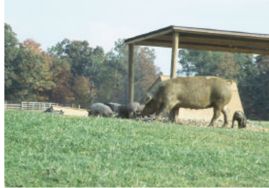
Outdoor sows in Southern Illinois