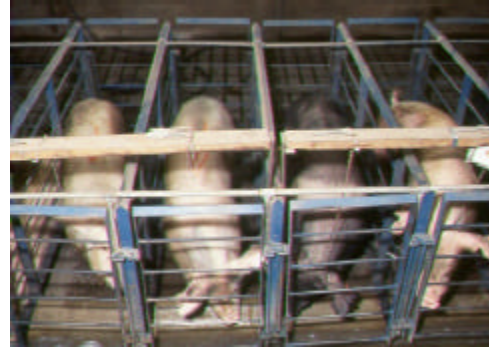
Sows in crates on concrete slats

Many other indoor production systems are available to house sows in social groups. In each indoor group-penning system, an attempt should be made to reduce social stress around feeding by allowing individual feed consumption by use of a feeding stall of some sort. Alternative indoor production systems for sows are not universally accepted as improving sow welfare. While sows can socially interact, they can also injure one another by biting each other's vulva and by biting, pushing and riding one another. The only way currently available to reduce social stress among indoor group-housed sows is to provide individual feeding areas and even then behavioral problems are common.