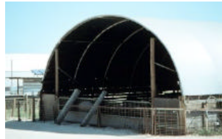
Outside of a bedded hoop building