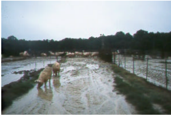
Outdoor sows on a wet Georgia farm