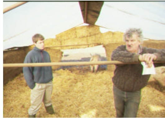
Outdoor sows in a straw tent in the UK