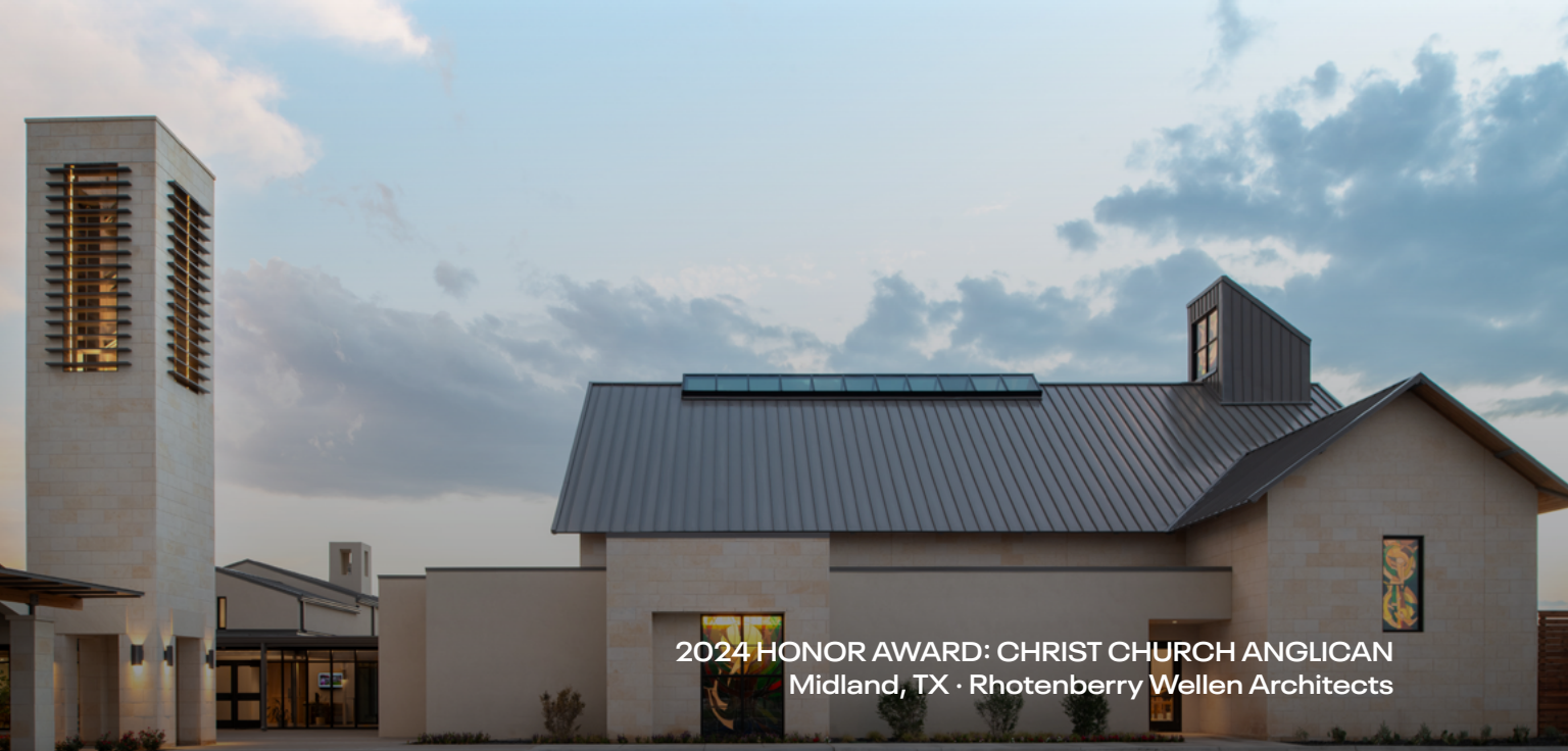
2024 HONOR AWARD: CHRIST CHURCH ANGLICAN Midland, TX · Rhotenberry Wellen Architects