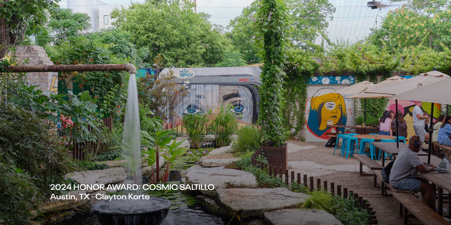
2024 HONOR AWARD: COSMIC SALTILLO Austin, TX · Clayton Korte