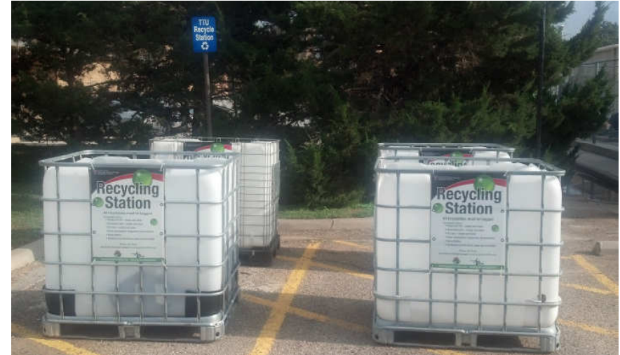
Keep the recycling in the bags! This is a requirement and makes sorting easier for the company who picks them up later.

Using a personal vehicle, a departmental vehicle or on foot, drop the plastic and aluminum recycling off at the TTU recycling station behind Housing Services – see map below.