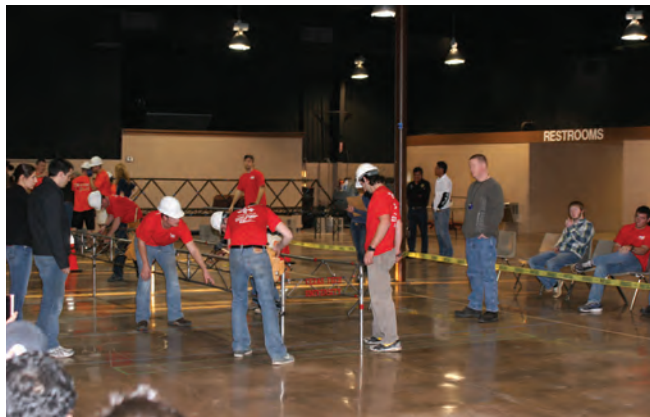
Texas Tech's Steel Bridge under construction during the competition.

A team from the ASCE Murdough Student Chapter at Texas Tech competed in the regional AISC-ASCE Steel Bridge Competition held in January 2012 at the Pasadena Convention Center in Pasadena, Texas.