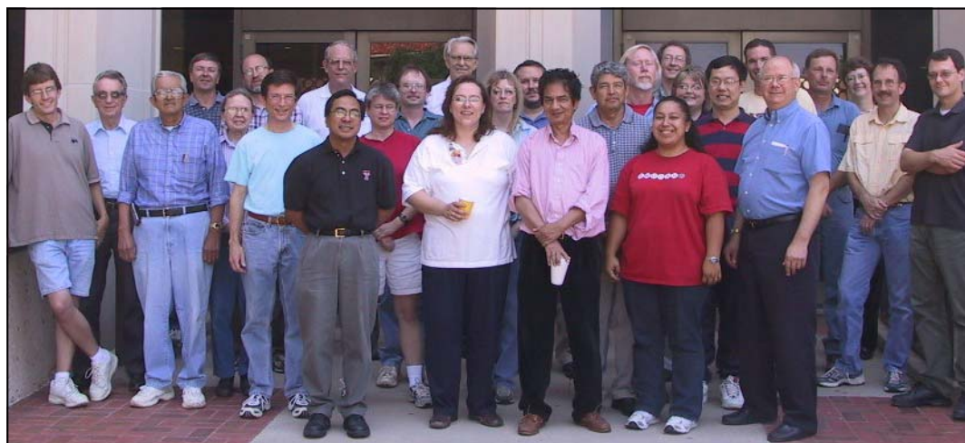
Many of the Department of Chemistry and Biochemistry faculty and staff gather for a photo on the front steps of the Chemistry Building in June 2005.