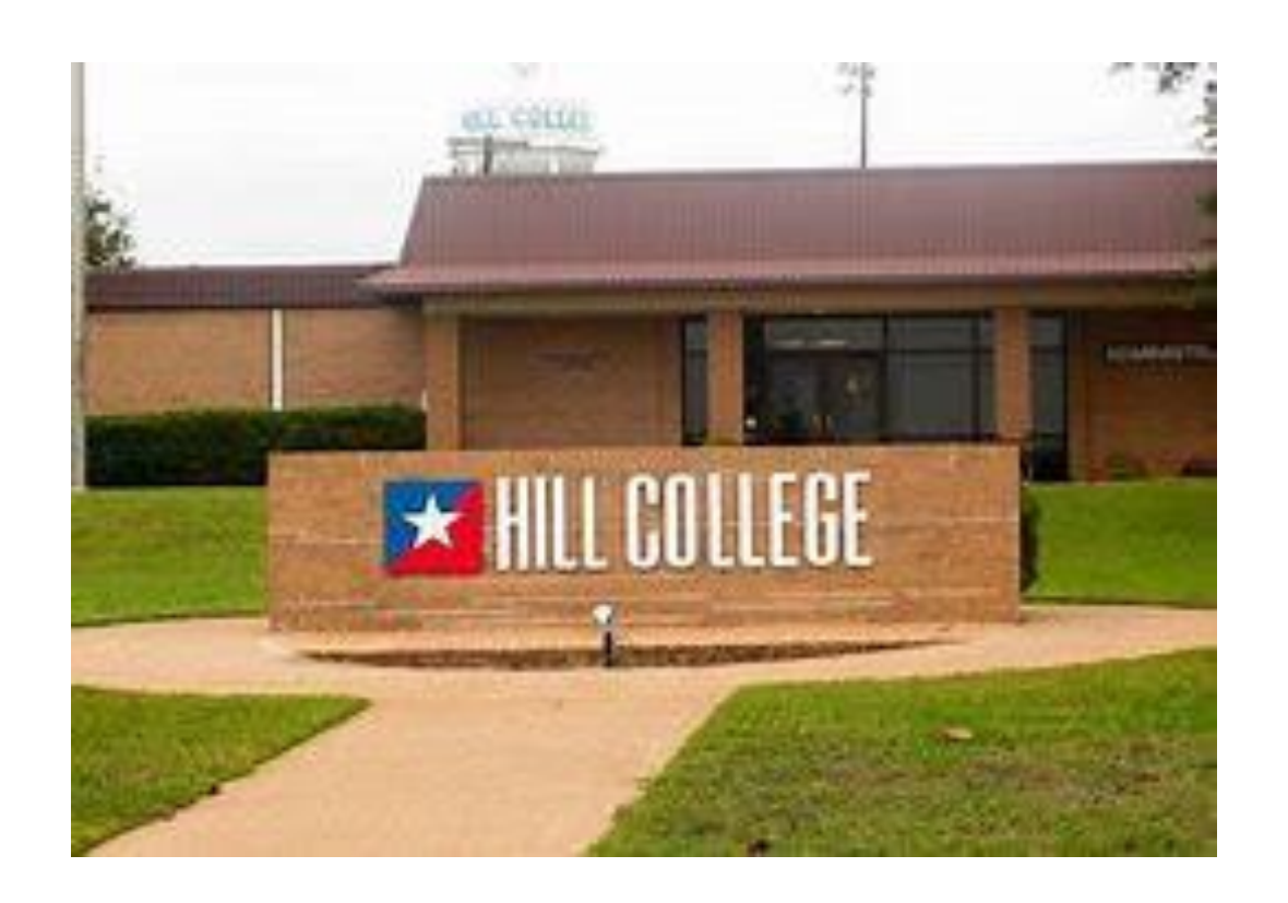
Texas Tech University at Hill College